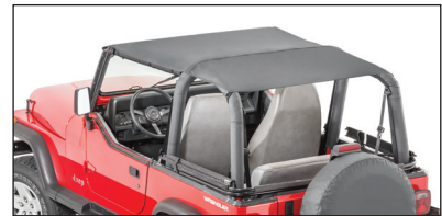
Bimini Top Plus: for 1992-1995