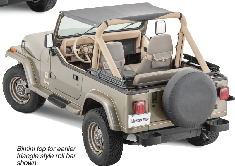
Bimini top for earlier triangle style roll bar shown