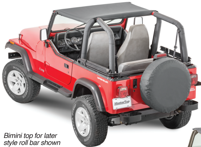
Bimini top for later style roll bar shown