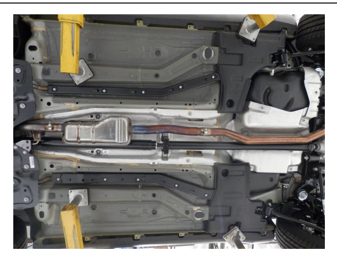
Step 1. Begin removal of the OEM exhaust system by loosening the clamp behind the factory resonator.