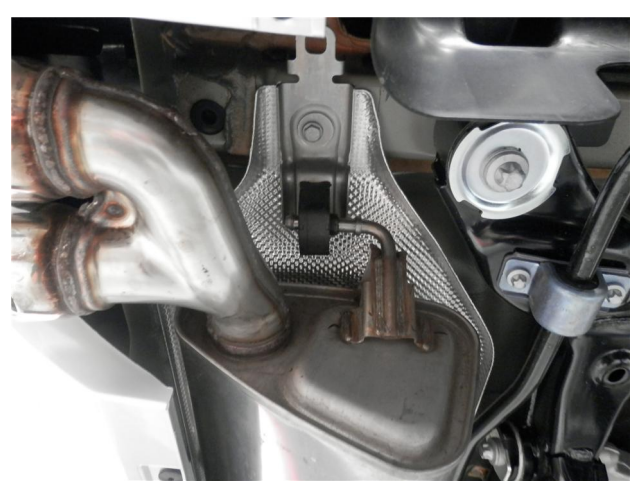
Step 2. Disengage the hangers from the rubber insulators and remove the OEM exhaust.