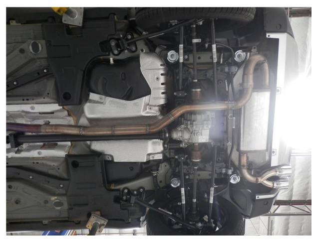
Step 3. Begin installation of your new MAGNAFLOW system by attaching the Inlet Pipe to the factory outlet using the supplied 2.25" clamp. Keep all clamps loose until final adjustment.