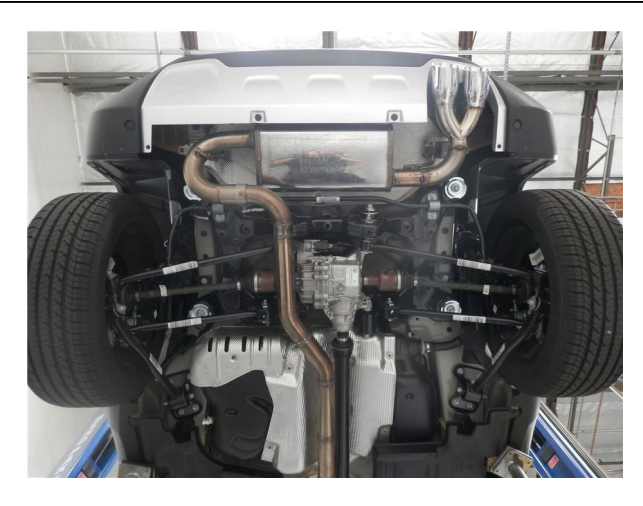
Step 4. Next using the supplied 2.50" clamp attach the Muffler Assembly to the Inlet Pipe. Fit hangers into rubber insulators.