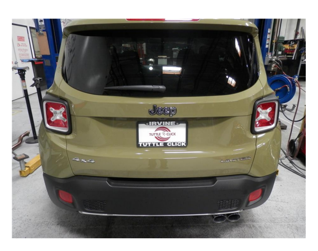
Step 5. Once a final position has been chosen for the new exhaust system, evenly tighten all clamps from front to rear using the torque specifications on page one of the instructions. Inspect all fasteners after 25-50 miles of operation and re-tighten if necessary.