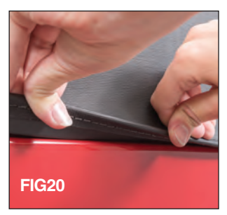
Step 11: Attach Side Curtains to Body Belt Rail

While pulling down, slip the side curtain bottom retaining channel into the body belt rail starting from one end and pressing down to the other as shown in Figs 19 & 20.