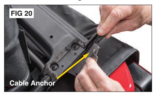
Step 6: Header Corner Pockets

Installation: Note: Figs 20 & 21 bows folded back to rear of vehicle. Rear corner shown.