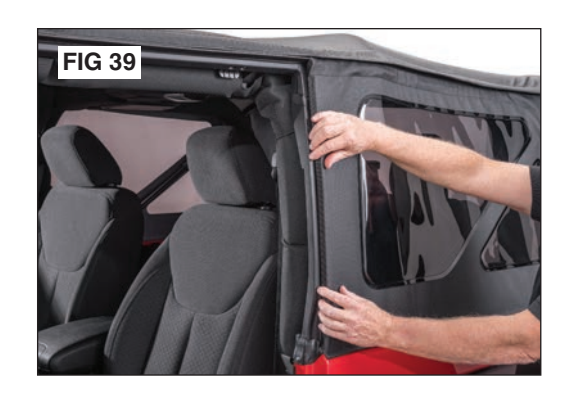
slot on the door surround. Repeat on the opposite side of the top. See Figs 38 & 39.