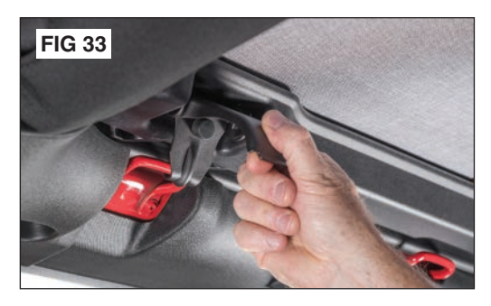
Step 13: Secure Top Front to Windshield With the cable spring installed, with two people (one on each side of the header) fold down the header to the windshield and close the front header latches to secure the front of the top to the windshield. See Figs 33-35.

Please Note: With the rear corners attached the first time you fold down the front header it will be EXTREMELY TIGHT. This is normal. We highly recommend that two people fold down the header simultaneously. This will prevent damage to the hardware system.