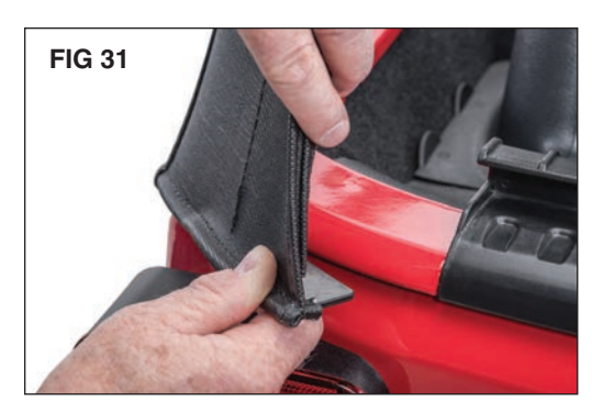
Step 12: Secure Rear Corners

If there are small "puckers" that form on the rear seam after the front header is secured, we suggest unscrewing and reinstalling the rear bow screws after Step 19 with the rear window installed.