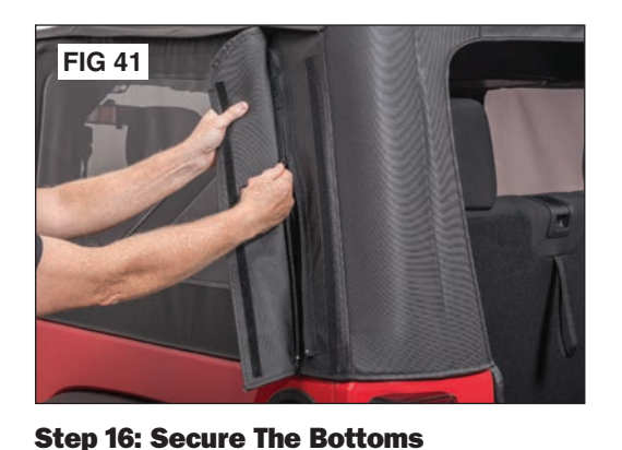
of the Quarter Windows Roll the bottom of the quarter window into the retainer channel on the vehicle and then close the quarter window zipper the rest of the way. Close up the hook and loop fasteners around the zippers.