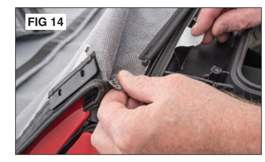
Step 4: Secure Top in Lower Header Working from the center out, secure the top in the lower header channel with masking tape holding it in place for installing the top plate to the lower header. Use 5-6 pieces of tape to hold the top in place. Note: The tape pieces will be completely covered when the top plate is put back on the lower header. See Figs 13, 14 & 15.