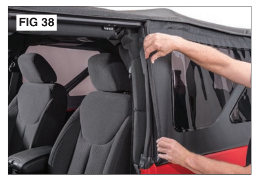
Step 15: Front of Quarter Windows Attach the front of the quarter windows along the front edge of the vertical door surround by rolling the plastic into the