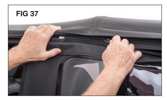
window and zipping it closed 2-3 inches. Repeat this on the other side of the vehicle. See figs 36 & 37.