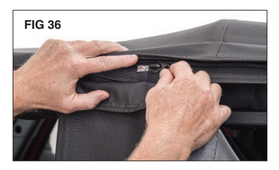
Step 14: Attach Quarter Window Zippers Attach the quarter window zippers by starting the zipper on the quarter

The leading edge of the soft top must be secured to prevent the loss of the top at speed. Latches must be fully closed and free of mud and other contamination. Do not use top if either latch is damaged.