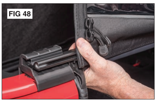
retainer as shown in Figs 45 & 46. After sliding the retainer all the way through the "C" Channel, roll the tailgate bar into the mounts with the outside of the fabric facing towards the rear of the vehicle. See Figs 47 & 48.