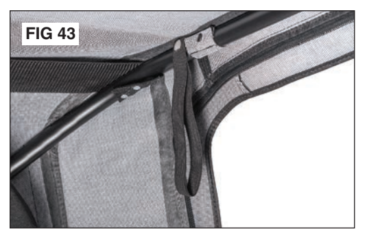
Step 17: Elastic Window Roll Straps Snap the elastic window roll straps on the rear bow above the rear window opening as shown.