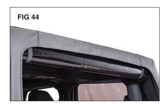
These handy straps can be used to secure your rear window when rolled up. See Figs 43 & 44