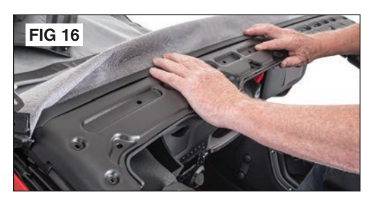
Step 5: Reassemble Lower Header Close the upper header over the taped down fabric sandwiching the fabric but leaving the underside faced up on the hood (See Fig 16). Using the screws you removed in step one, reinstall the four corner screws and then the 19 or 27 (depending on model year) screws along the top of the header. See Figs 17 & 18. Un-latch the bow assembly from the windshield (inside vehicle) and lower the bow assembly to the rear of the vehicle folding the top back over with the underside of the fabric facing down (see Fig 19).