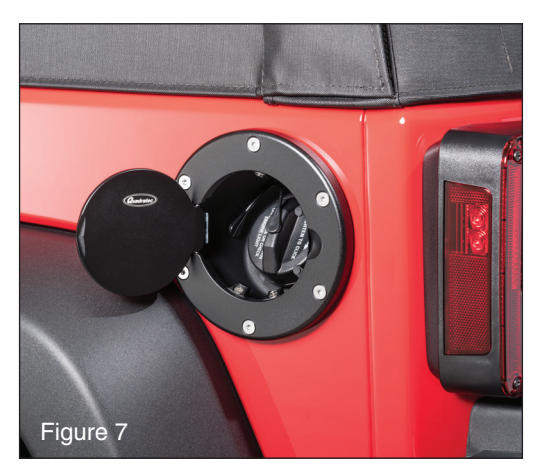
Non-locking style cap installed complete in open door position.