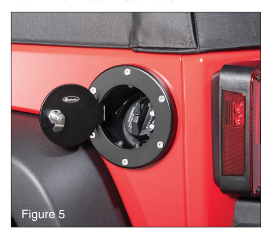
Note: Fuel cap may interfere with the locking mechanism if the cap is left in the horizontal position. If this occurs rotate the cap to a vertical orientation as shown above in FIG5.