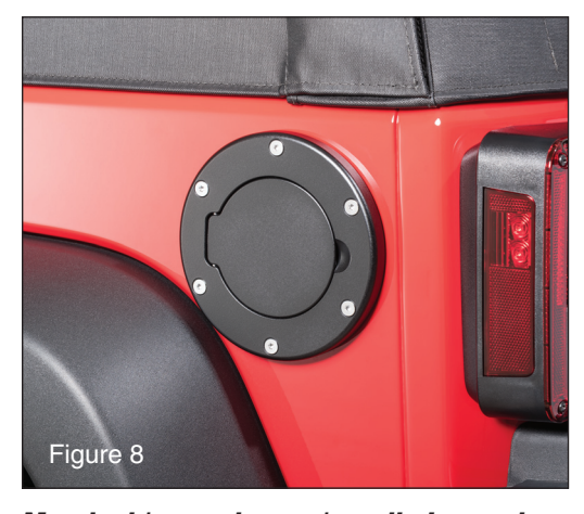
Non-locking style cap installed complete in closed position.