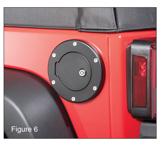
Locking style cap installed complete.