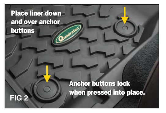
Step 2: Place the driver side liner down into position and align the original equipment carpet anchor buttons with the anchor discs in the Quadratec floor liner. Press down on the anchor discs in the floor liner and make sure that they click and lock into place as shown in Figure 2.

Step 3: Repeat steps 1 and 2 on the passenger side and rear floor liner (if applicable).