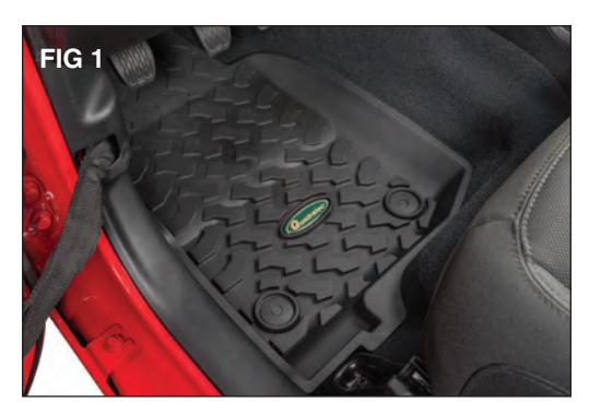
Step 1: Permanently remove all existing factory or aftermarket floor mats or liners. Do not stack or combine your new floor liners over any other floor mats or liners. For best results, we recommend vacuuming your vehicle carpet before installation. Make sure carpet is dry.

READ AND FOLLOW ALL INSTRUCTIONS. Unsecured Front Liners may shift, restricting pedal movement which may lead to loss of vehicle control. TO AVOID RISK OF SERIOUS INJURY: Front Driver's Side Liner MUST Be Secured with the anchors that came with your Jeep®. Replace factory carpet anchor if damaged or missing. DO NOT STACK ANY OTHER LINERS OR MATS OVER OR UNDER your Ultimate Floor Liner. Floor Liner MUST be anchored directly to carpet.