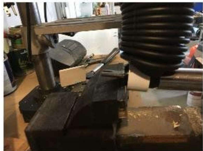
Stop and remove when Bushing is through to the opposite side.