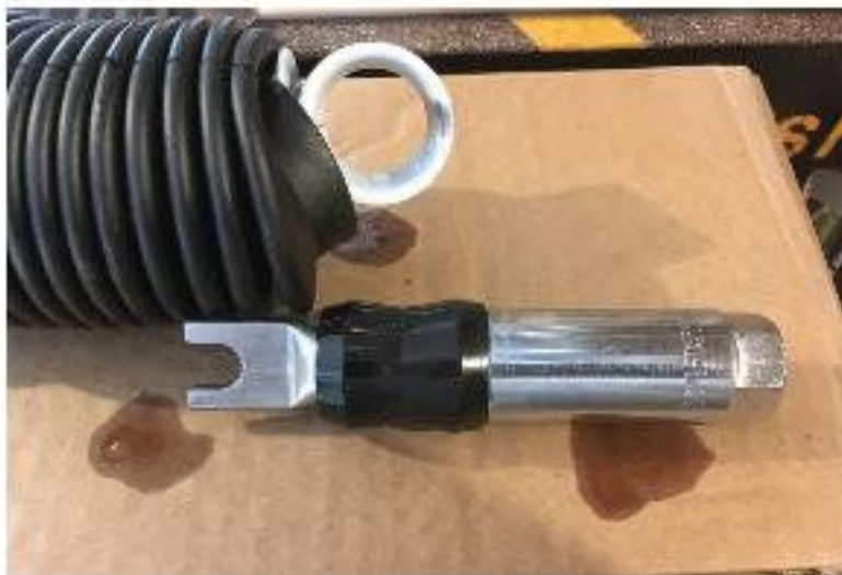
Use a 13/16" Deep Well Socket for pressing the Bushing into the Shock.