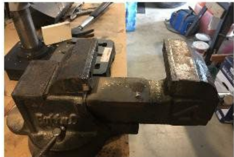
Open a 6" bench vise wide enough to insert Shock and socket.