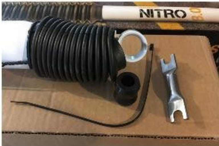
Parts for Rear Top Mount. Note Boot On Shock First!