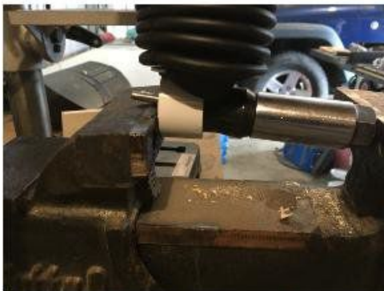
Note mount end on top of vise jaw, supporting the Shock, with everything aligned, start closing the vise.