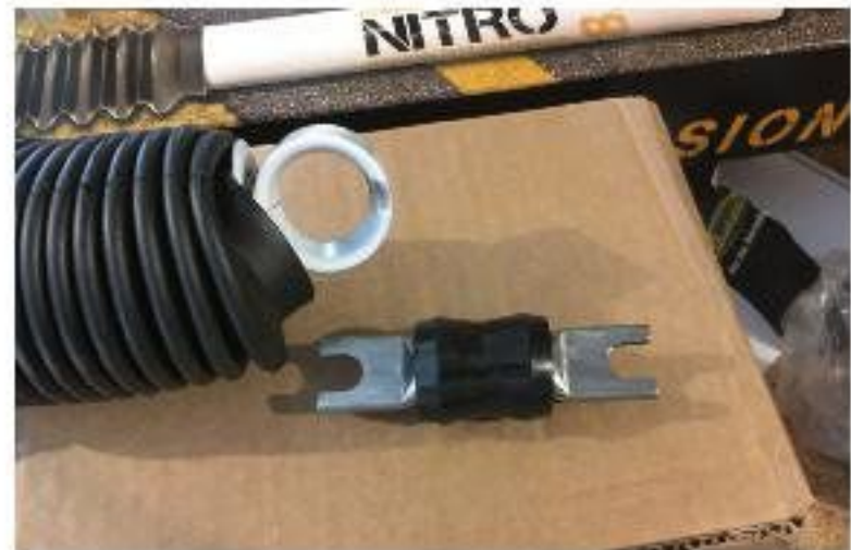
Slide Bushing on Mount. Make sure the Boot is on the Shock before pressing.