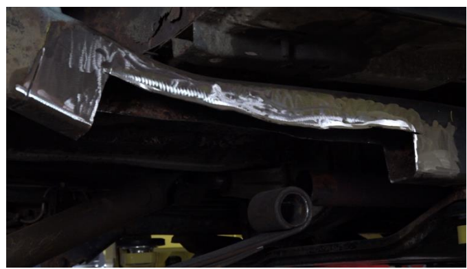
(OPTIONAL): Coat the part with a weld-able primer or other rust inhibitor to help prevent or reduce the risk of rust formation.