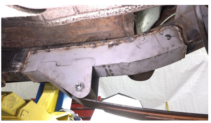
100% weld around all edges.