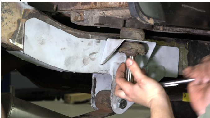
C-clamp or tack weld the part into place to prevent it from moving later.

Replace the part and the body mount bushing. Reassemble the leaf spring with the included bolt, and resecure the body mount bolt. This will ensure the proper location of, and tension is applied to, the new part.