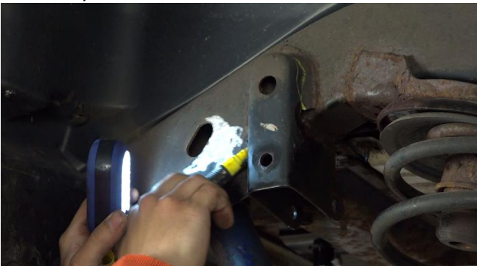
Mark around all edges of the track bar bracket.

Remove track bar from the bracket. Down and out of the way.