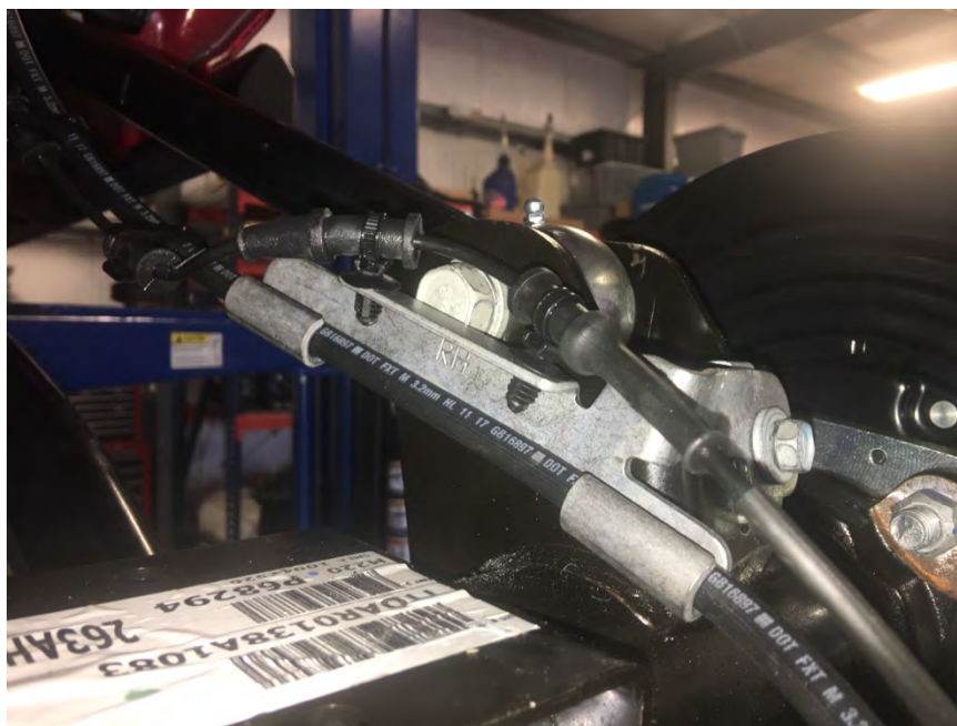
New Orientation for Rear Brake Line Brackets