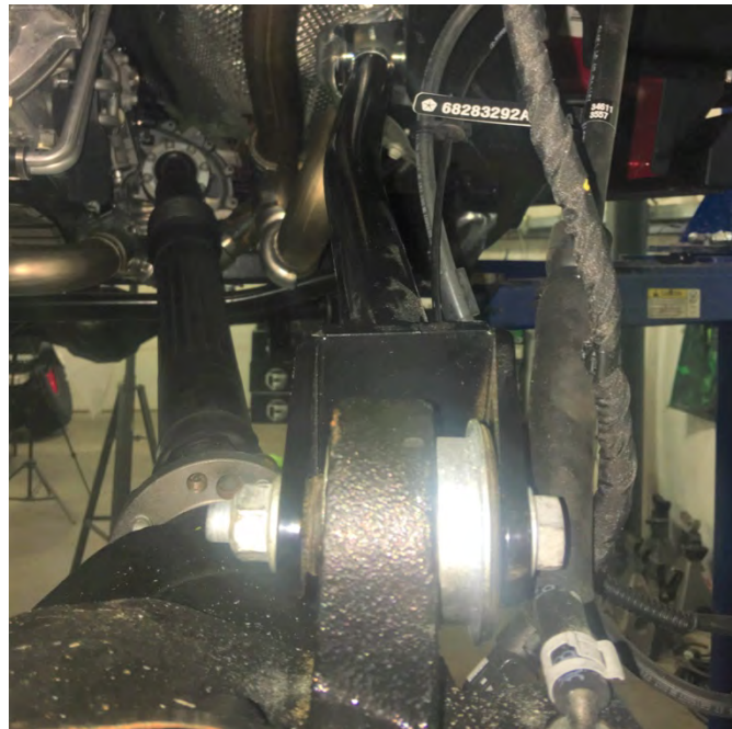
Driver Side Front Upper Arm Showing Proper Bend Orientation (Away From the Frame)