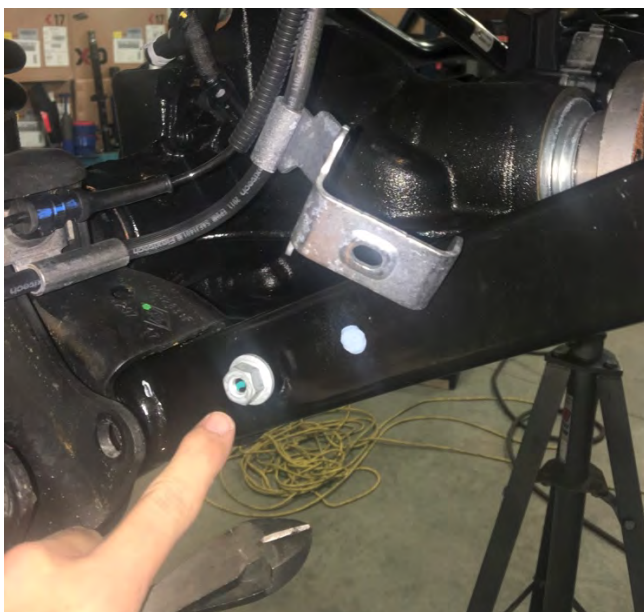
Remove Brake Lines from Arms