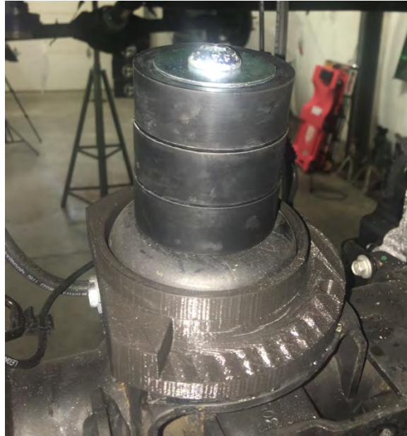
New Bottom Spring Seats Shown with Bump Stop Stack in Place