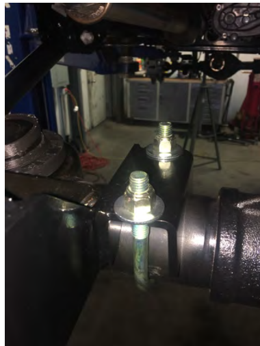
1/2" U Bolt