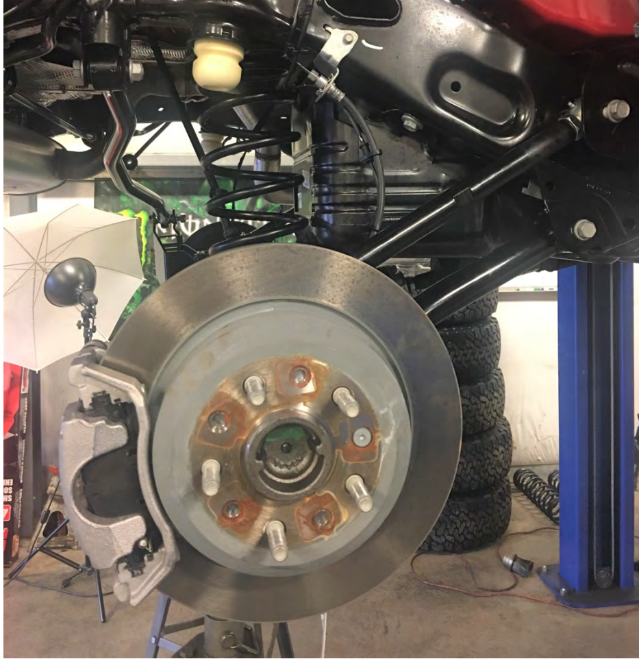
Rear Uppers and Rear Lower Installed in the Vehicle