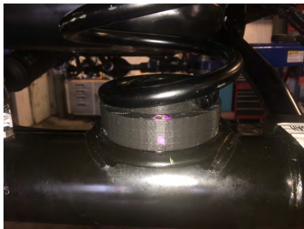
Pass. Side Spring Seat w/ Spring Installed

*Please note: The markings are for LHD applications. RHD applications will be reversed.