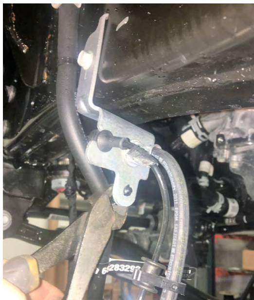
Clip for Breather Line Slack