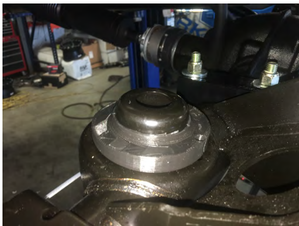
Driver Side Spring Seat