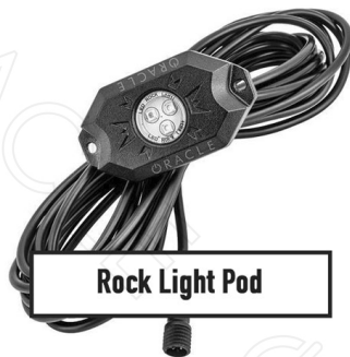
Rock Light Pod

* Never Cut or Modify the Rock Light Pod Cables. To extend use the Rock Light Extension Cable (ORACLE Part # 5814-504)*