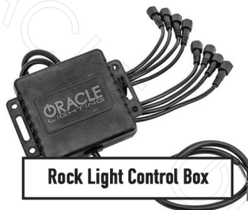
Rock Light Control Box