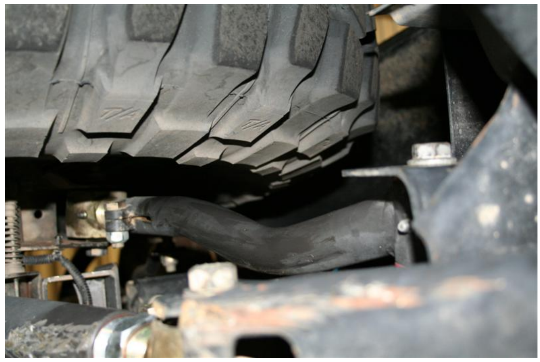
<u>Installation is complete</u>