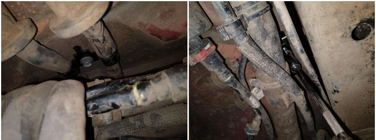
Figures 1 and 2. Removing the Factory Parking Brake Cable Bracket