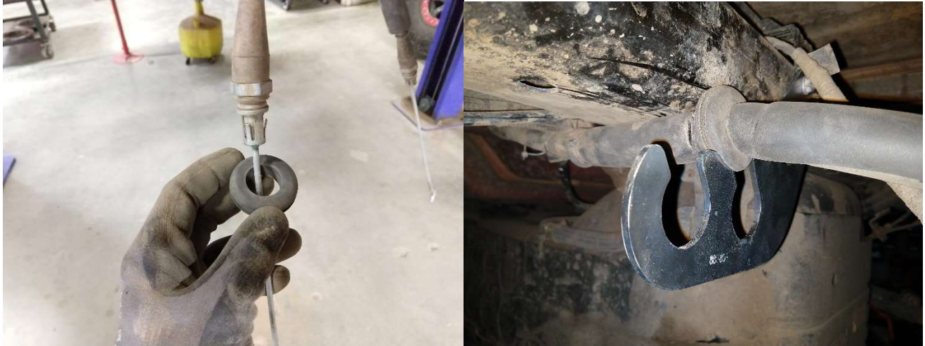
Figures 4 and 5. Installing Grommet on Cable