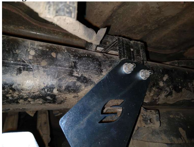
Figure 3. Synergy Parking Brake Cable Bracket Installed