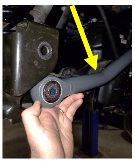
Figure 5. Installing the Synergy Mfg Track Bar at the Axle