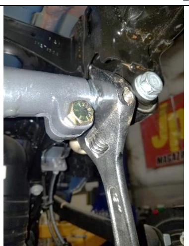
Figure 7. Adjusting the Track Bar to Center the Axle

8. With a 3/4 inch socket and wrench, tighten the pinch bolt at the double adjuster on the track bar to 90 lb-ft. See Figure 8 .