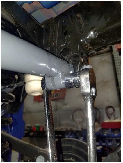
Figure 8. Tightening the Pinch Bolt and Nut

8. With a 3/4 inch socket and wrench, tighten the pinch bolt at the double adjuster on the track bar to 90 lb-ft. See Figure 8 .