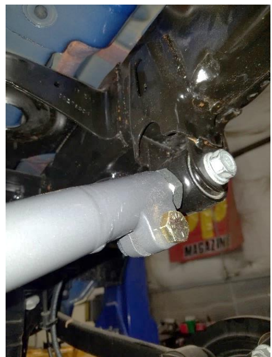
Figure 4. Installing the Synergy Mfg Track Bar at the Frame

4. Install the Synergy Mfg track bar by putting the adjustable side in the frame side track bar mount and reuse the OEM bolt and nut. Make sure the bend in the bar and the pinch bolt bungs face down. See Figure 4 .