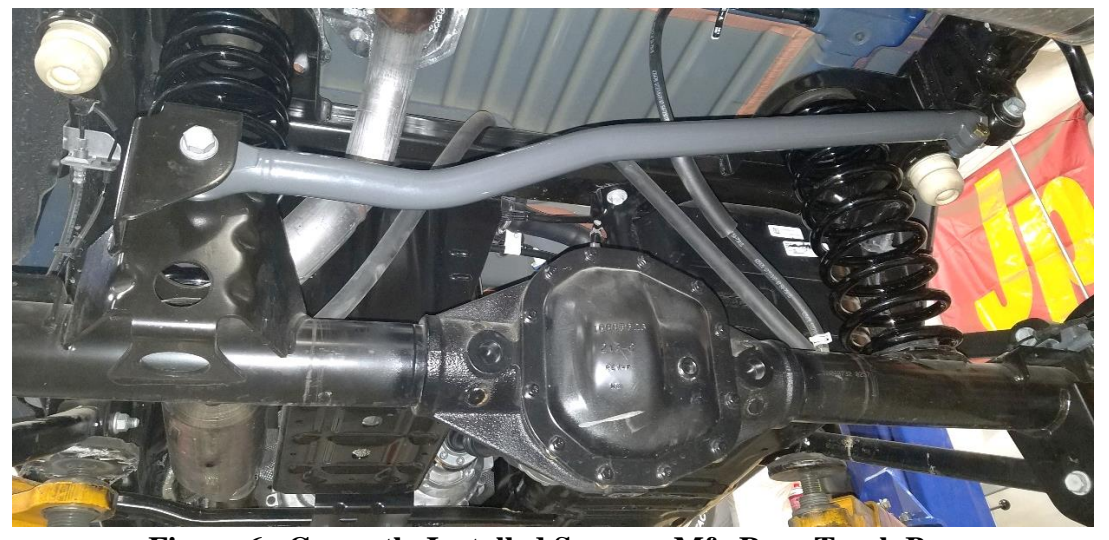
Figure 6. Correctly Installed Synergy Mfg Rear Track Bar