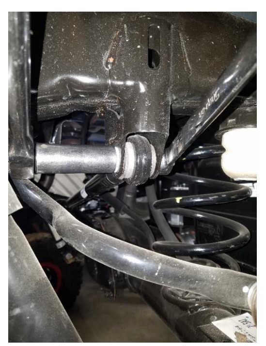
Figure 3. Removing the Track Bar from the Frame Side

4. Install the Synergy Mfg track bar by putting the adjustable side in the frame side track bar mount and reuse the OEM bolt and nut. Make sure the bend in the bar and the pinch bolt bungs face down. See Figure 4 .