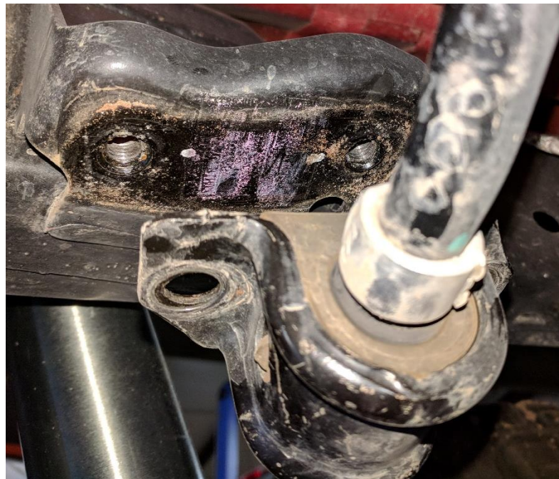
Figure 1. Driver Side Rear Bracket Removed from Frame