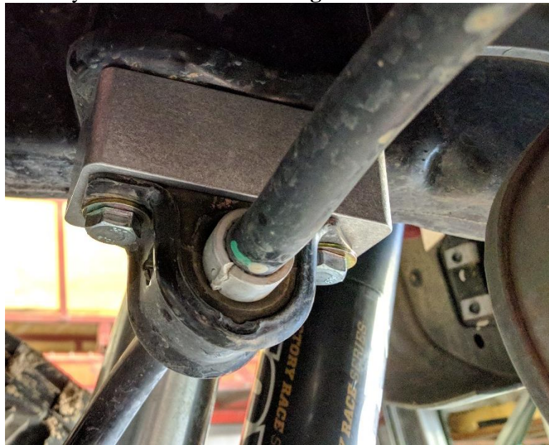
Figure 3. Passenger Side Spacer Block Installed