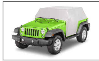
for 07-18 JK Wrangler 2-Door