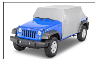
for 07-18 JK Wrangler 4-Door