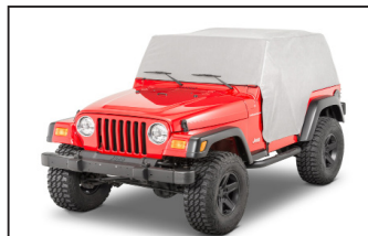
for 92-95 YJ & 97-06 TJ Wrangler

RISK OF EYE INJURY. SAFETY GLASSES SHOULD BE WORN AT ALL TIMES WHILE INSTALLING OR MAINTAINING THIS PRODUCT.