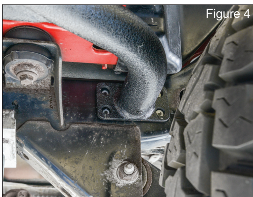
Once the guards have been positioned properly you will need to trace the mounting holes of the front and rear brackets against the frame with a paint pen or marker as shown. (Figure 4)