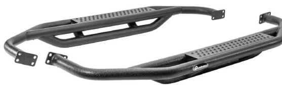
Side Armor with Step Pair