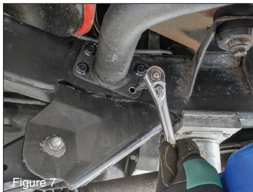
Figure 7 Reposition the rocker guard over top of the holes in the frame and install the (8) 3/8 x 1" self tapping screws with a 13mm socket and ratchet. (Figure 7)