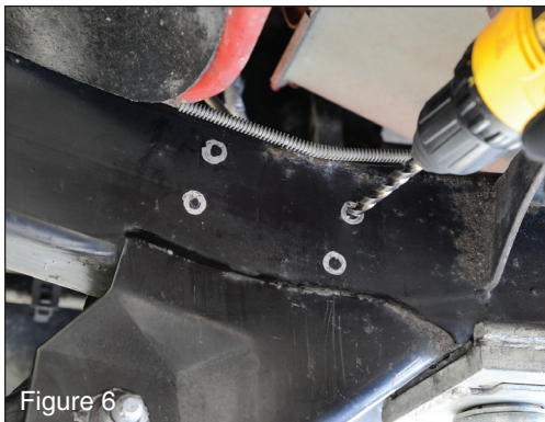
Figure 6 Drill holes in the frame with a drill and 5/16 drill bit. You may want to drill a pilot hole with a smaller bit first. (Figure 6)