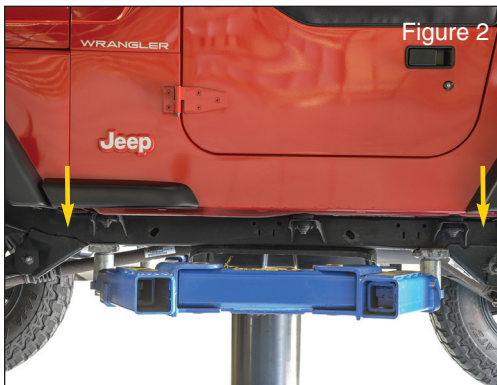
Locate the areas of the frame that are in front of the front body mount and behind the rear body mount as shown. (Figure 2)