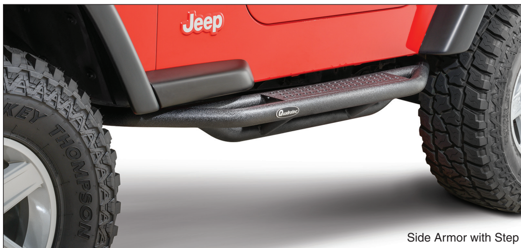
Side Armor with Step