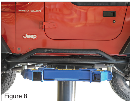
Figure 8 Repeat the steps on the opposite side. Installation is complete.