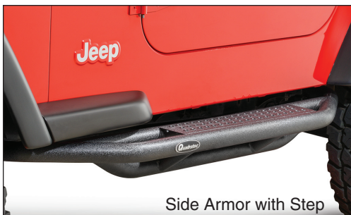
Side Armor with Step