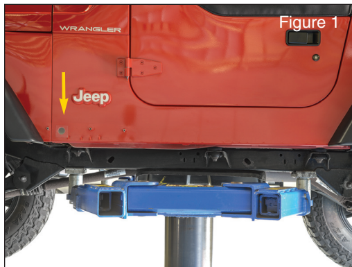
Removal or modification of the fender flair extension may be required when installing the rocker guard(#12004.3202) BUT NOT THE SIDE ARMOR (#12004.3212). (Figure 1)