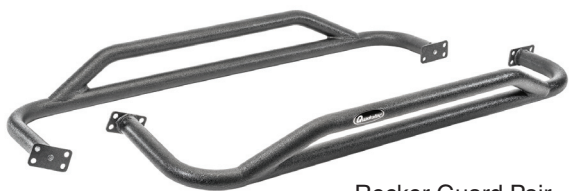
Rocker Guard Pair