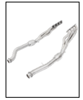
P/N: 48-36211-YC (Street)