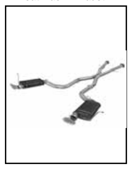
P/N: 49-38058 (No Reson.) 49-38059 (w/ Reson.)