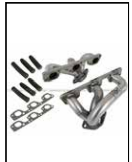
Twisted Steel Headers