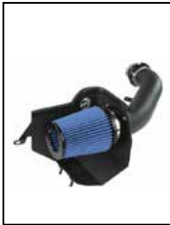
Magnum Force Intake System