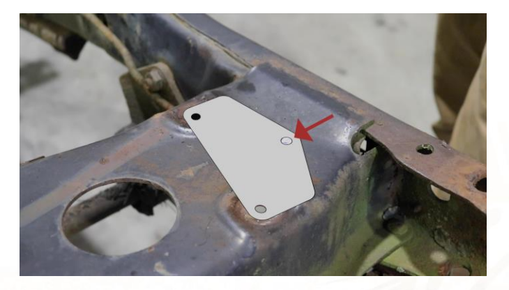
With a 1/2" drill bit, drill out the marking.