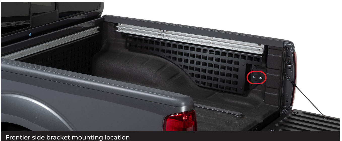
Frontier side bracket mounting location

Note: Some Nissan Frontiers do not include tie-down hooks, leaving the mounting holes blank. In this case, use a pliers or a trim-removal tool to pull out the plastic plugs where the tie-down hooks would be, then attach the side brackets using the supplied M8 bolts and a T40 Torx driver.