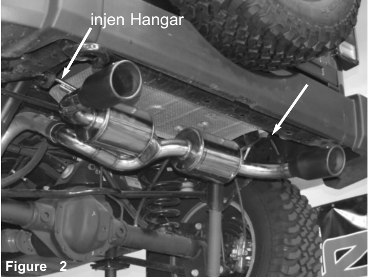
Make sure the hangars on installed to both the factory isolators. Position for the best fit. Rotate if necessary. Tighten the torsion clamp using 17mm socket and ratchet. Re-tighten after 50miles and verify the clamp is securred. Congratulations! You have just completed the installation of this intake system. Periodically, check the alignment of the exhaust. Note: Check clearance and adjust if needed! Failure to check the alignment and adjust the exhaust can cause damage that will void the warranty. Injen Technology is not responsible for any damages caused by/from improper installation.