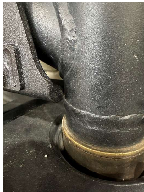
Figures 4 (top left), 5 (top right), 6 (bottom left), and 7 (bottom right)