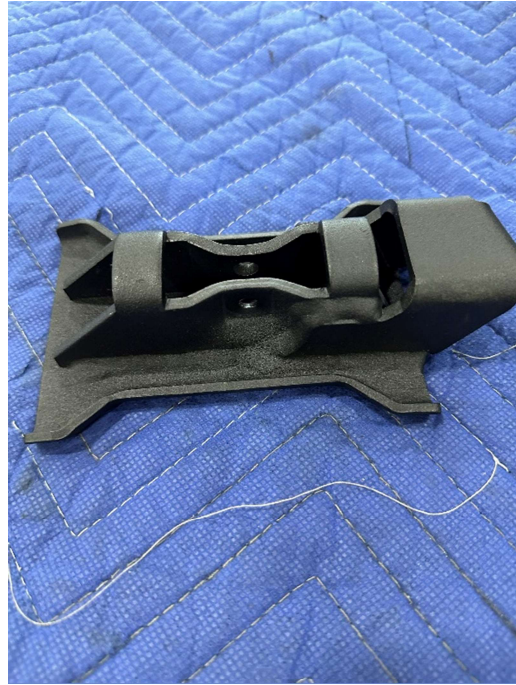
Figures 8 (left) and 9 (right)