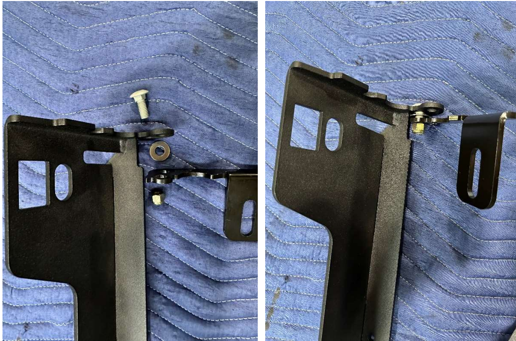
Figure 1 (left) and 2 (right)