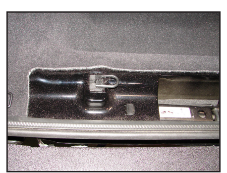
Position the floor panel clip as pictured to allow it to fit in the void in the bottom of the Stealthbox®.