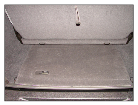
S T E P 1 Empty out the cargo area so that you have a clean area to work in.