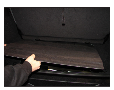
STEP 2 Fold the rear seat forward, and remove the floor panel.