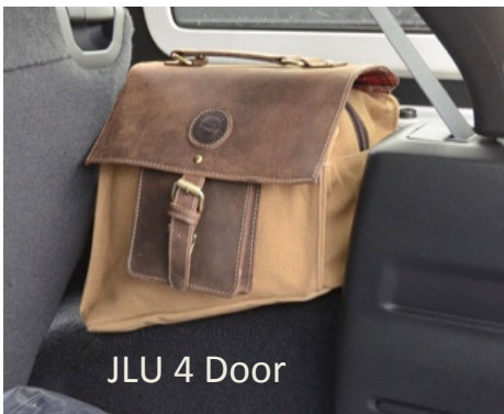
JLU 4 Door

Like your favorite pair of jeans, perfectly fitted fabric products may be a bit tight when they're new and like your jeans after a little use they'll stretch to that perfectly comfy fit you love so much. The initial fit of Saddlebag zipper strip is designed to be very tight for the same reason. When installing the strip to the Jeep tub, pull it tight to stretch it so the grommets line up with the holes in the tub/hardtop. This is normal and will ensure a good fit over time.