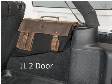
JL 2 Door

Attach the included zipper strip to the hardtop bolt holes on the top edge of the tub. If the Jeep does not have a hardtop but does have the factory captive nuts for the hardtop under the tub rail, use 8mm x 1.25 x 20mm long screws (not supplied) to attach the zipper strips. If the Jeep does not have the factory captive nuts, 3/4"-long 5/16 screws and nuts or 20mm-long 8mm screws and nuts (not supplied) can be used to attach the zipper strips.