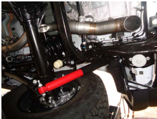
ROCK CRAWLER OPTION

Step 2. Install your new system by first loosely attaching the Inlet Assembly to the DPF with the supplied 2.75" clamp. Engage the welded hanger to the rubber insulator. Keep all clamps loose to allow for final adjustment.