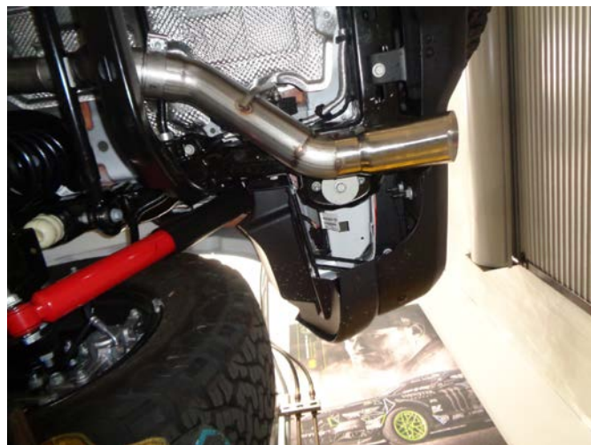
BLACK TAIL PIPE OPTION

Step 3. Your MAGNAFLOW system comes with a choice of a Black Tail Pipe or a "Rock Crawler" Tail Pipe. Both attach in the same way. Attach the Tail Pipe inlet to the Inlet pipe using the supplied 3.00" clamp. Engage the welded hanger to the rubber insulator.