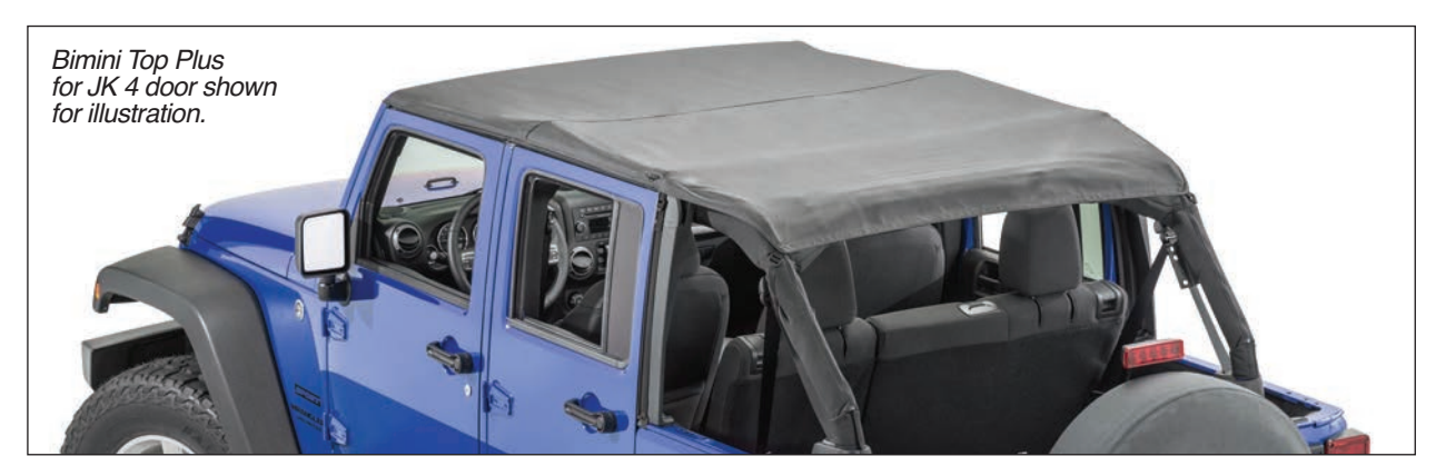
Parts List: Fabric Bimini Top or Bimini Top Plus, Qty 1

Items #14100335, #14300335 and #14300435