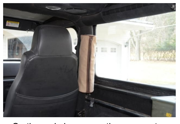
On the main hoop over the rear seat