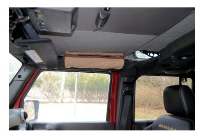
On the main roll bar hoop (two can fit)