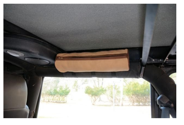
On the main hoop down bars