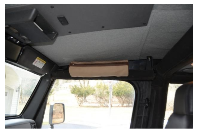
On the rear down bars