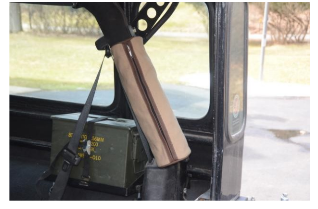
On the main hoop over the front seats