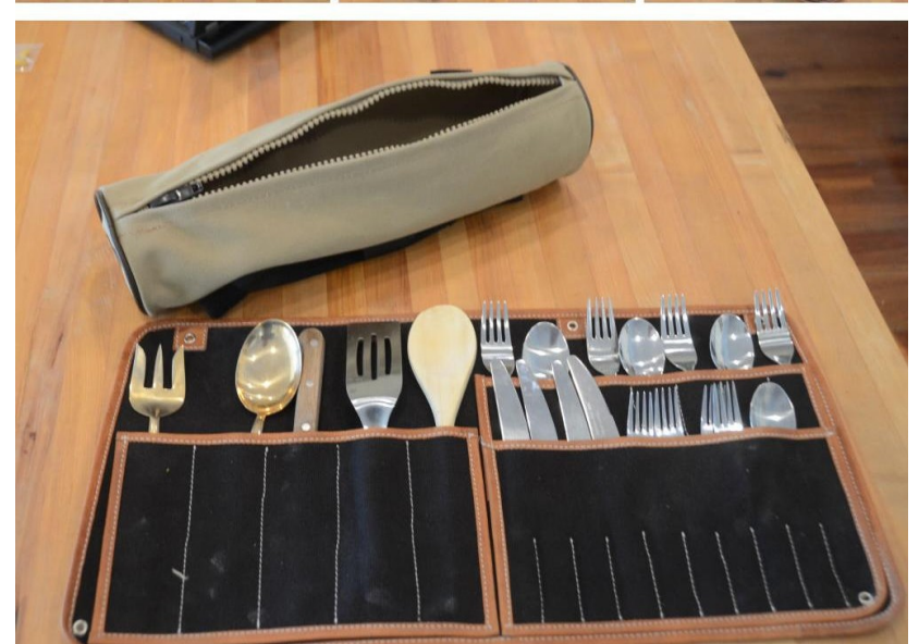
or a tool roll