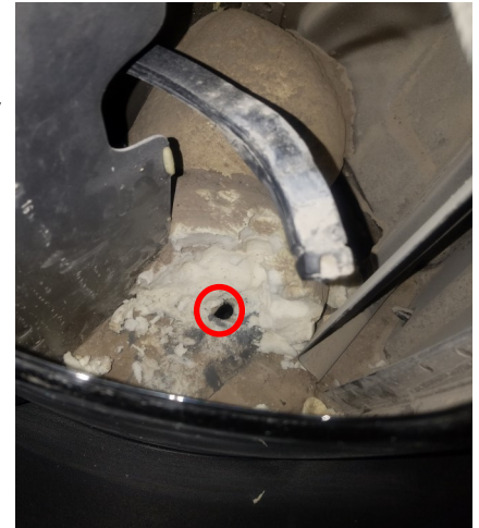
Figure 2: Foam removed and hole exposed.