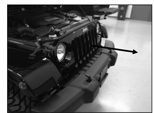
Once clips are removed, remove grille by pulling straight out and unhooking the marker lights.

2. Remove 6 plastic retaining clips with flat head screw driver (locations shown above) by removing center rivet pin first.