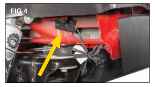
Reconnect the bumper harness to the vehicle until you hear a "click" and slide the gray locking tab to lock plug in place. Loop the excess harness up out of