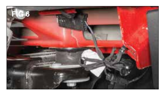
Route the light harness down towards the OEM bumper harness and connect it to the original license plate light plug until you hear a "click". (FIG 6)