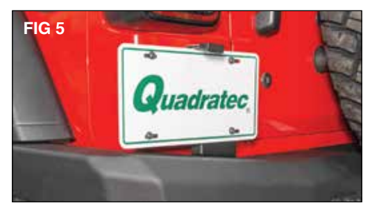
the way and secure using the provided cable ties. (FIG 4) Mount your license plate and the included light to the bumpers license plate bracket. (FIG 5)