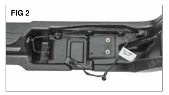
Put on safety glasses. Locate the bumper's wiring harness and remove all cable tie mounts using a clip/trim removal tool.