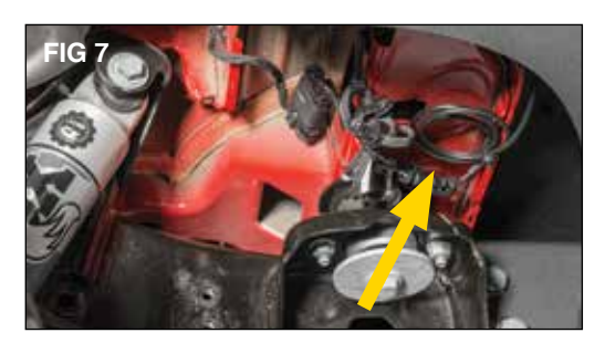
Loop the excess harness up out of the way and secure using the provided cable ties. (FIG 7)