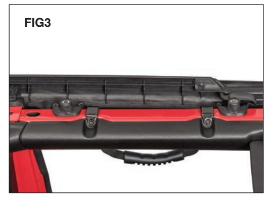
Install the grab handles using the original screws removed in Step2. (FIG3)