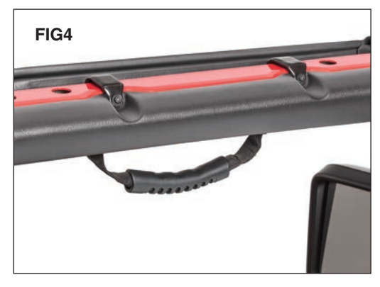
Repeat process for opposite side of vehicle from which you started.