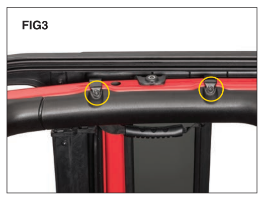
Install the grab handles using the original screws removed in Step2.