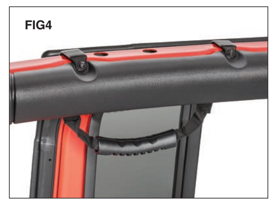
Repeat process for opposite side of vehicle from which you started.