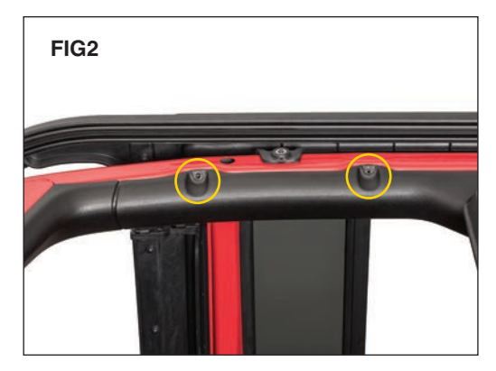
Remove the two screws using a T-25 driver. (FIG2)