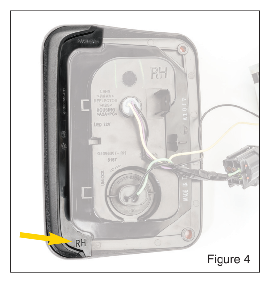
Locate and install the adapter plates provided with your LED taillights and install as shown. Note adapters are handed and marked LH and RH.