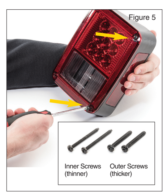
Reinstall the two outer screws that were removed from the factory taillight. Do not overtighten. Lenses could crack.