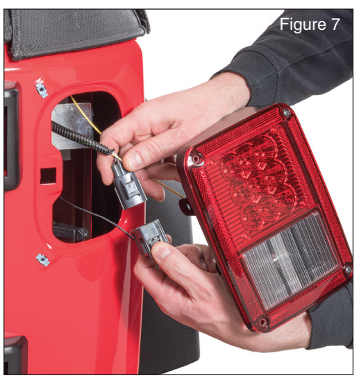
Connect the factory harness connector to the connector on your LED Taillight.