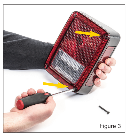
Remove the two outboard screws from your taillight using a Phillips screwdriver and retain them for use on your LED taillight.