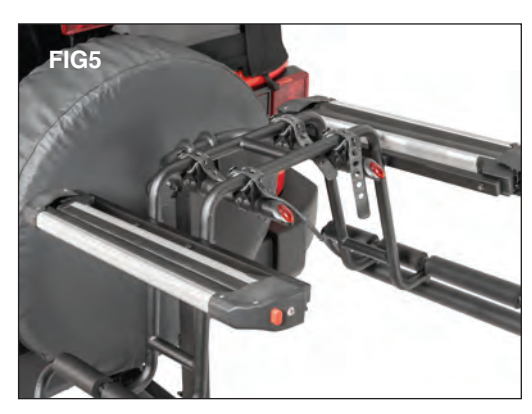
Adjust the cradles of your bike rack to fit the ski and snowboard rack. Place the rack into the cradles of the bike rack and secure it properly according to your bike rack instructions.