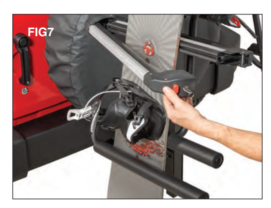
Drop the skis or snowboard through the opening in the u bracket and slide it into the open hinged clamp. Close the clamp and lock with the key.