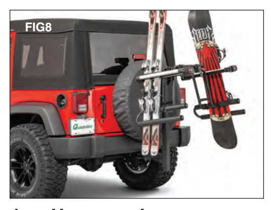
Assembly now complete.