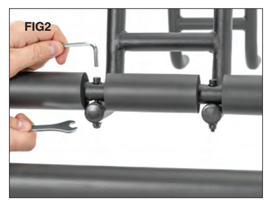
Secure the U bracket to the main rack with M6 x 60 cap screws (2), washers (4), and Nylock nuts (2). Tighten the bolts and nuts with the included M5 hex wrench and 10mm combination wrench. Repeat on opposite side.