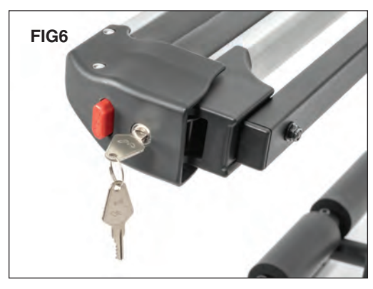
Install the key into the lock and turn it before pressing the red button to open the clamps.