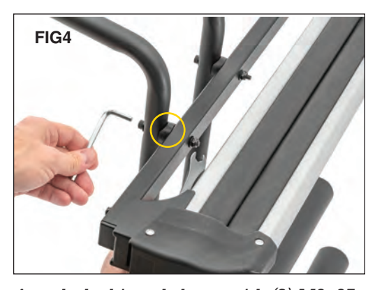
Attach the hinged clamp with (2) M6x65 cap screws, (4) washers, (2) plastic spacers, (2) nylocks. Place the plastic spacer between the outside of main frame and the hinged clamp. Tighten with the provided M5 hex and 10mm wrench. Repeat on opposite side.