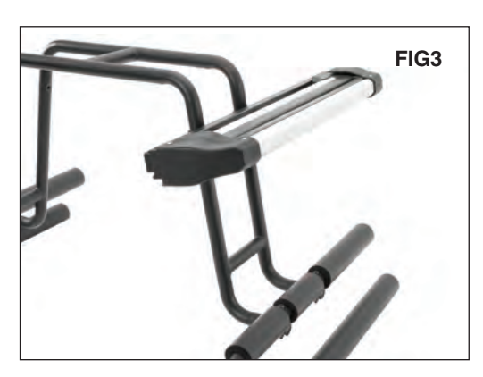
Position the hinged clamp over the upper holes in the main frame. Ensure the locking end of the clamp is facing the same direction as the open end of the u bracket.