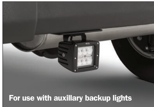
For use with auxillary backup lights