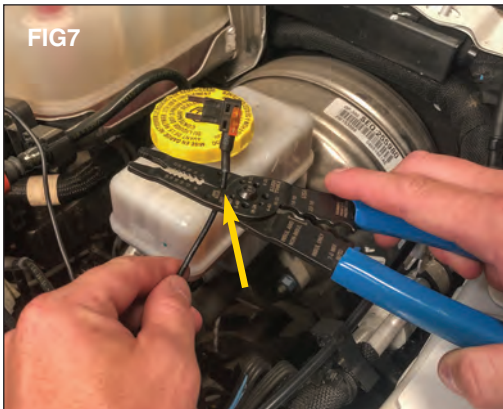
On J-Series light bars cut the fused end off and strip the end of the wire. (FIG 7)