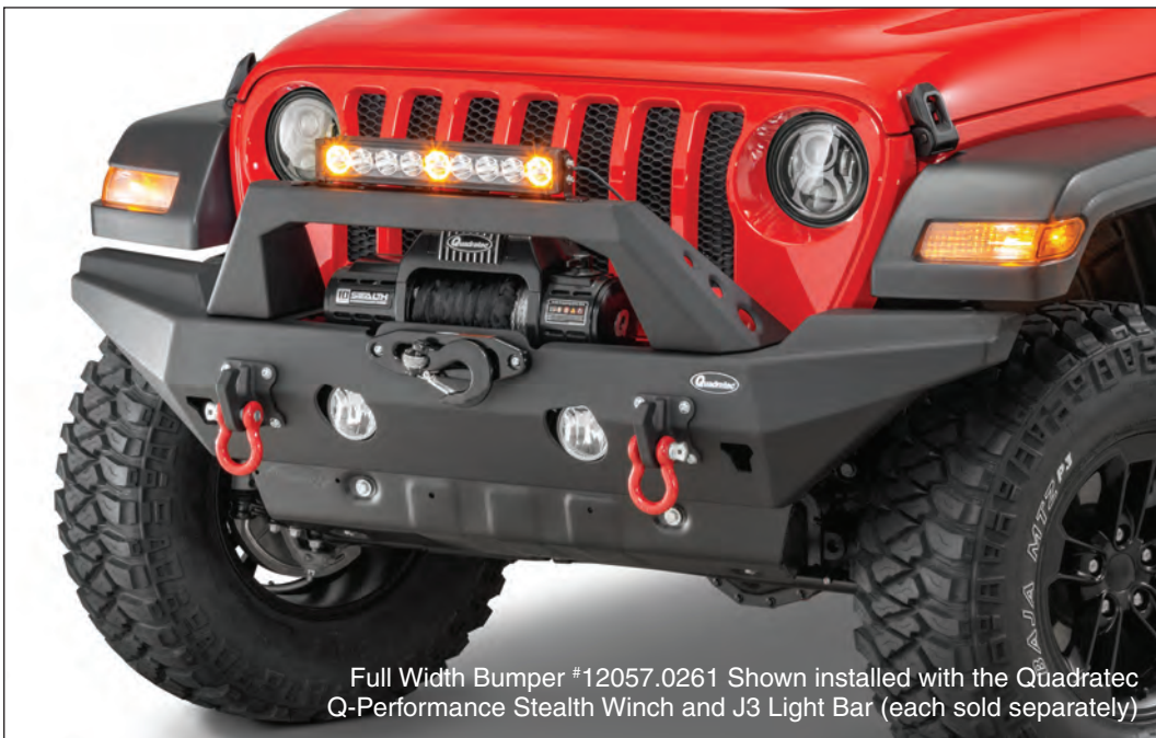
Full Width Bumper #12057.0261 Shown installed with the Quadratic Q-Performance Stealth Winch and J3 Light Bar (each sold separately)