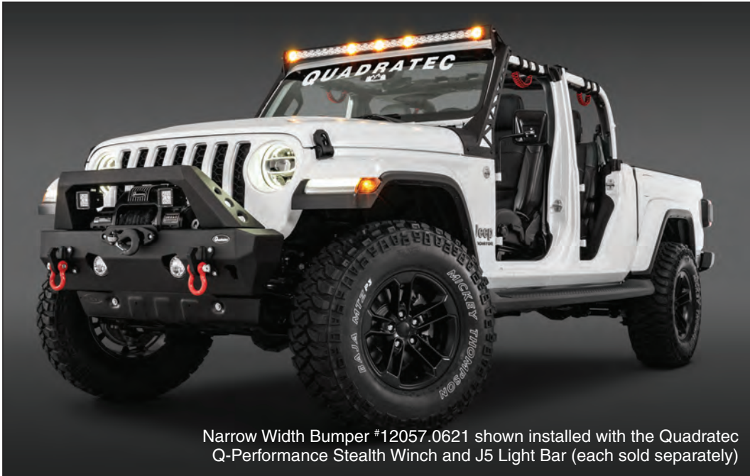
Narrow Width Bumper #12057.0621 shown installed with the Quadratic Q-Performance Stealth Winch and J5 Light Bar (each sold separately)