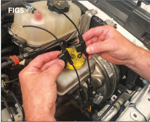
Connect the fused pigtail to the desired connector. (FIG 5) The red wire is for running lamps such as J-Series lightbars. The yellow wire is for vehicles with daytime running lamps and will have 12 volts when the engine is running.