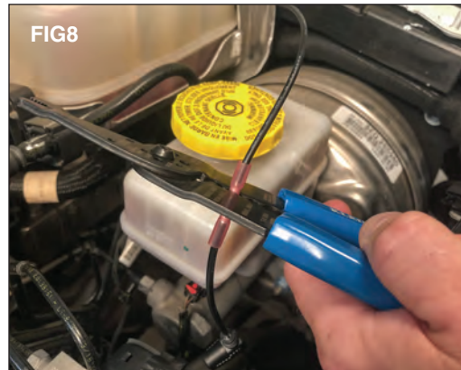
Connect the black wire from your J-Series light bar to the barrel connector and then used a heat gun to shrink the connector which provides a weather tight seal. (FIG 8)