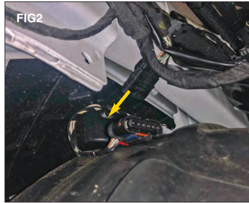
Slide the red locking tab backwards and disconnect the plug. (FIG 2)