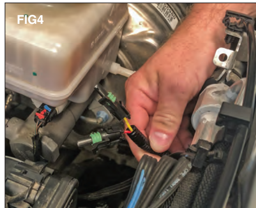
Route the two weather tight connectors up to the engine bay for easy access. (FIG 4)