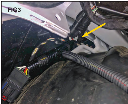
Plug in the new Tee harness to each side of the OEM harness until you hear a click and then push the red and gray locking tabs to lock the connections. (FIG 3)