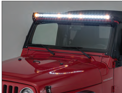
Clearance Lights with Off-Road Lights illuminated (Off Road only!)