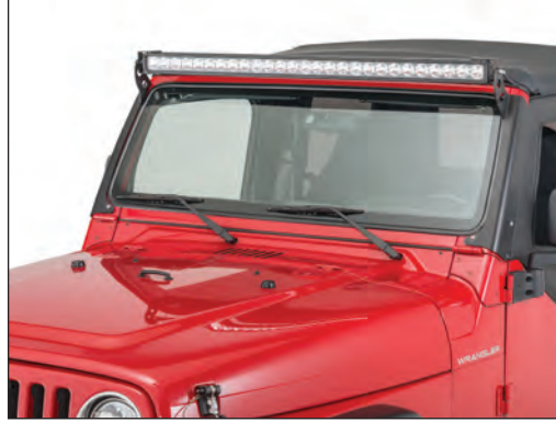
Normal Daytime Driving Mode (OK on-road)