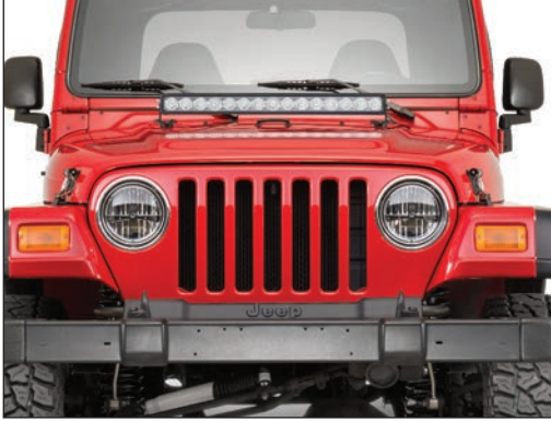
28" Lightbar Hood Mount w/Brackets (#97109.2002)