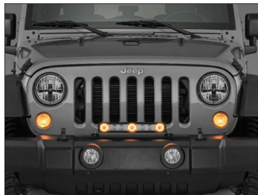
17" Lightbar Bumper Mount (Amber Lit)