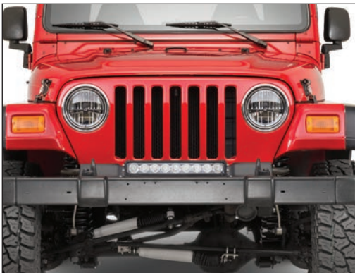
17" Lightbar Bumper Mount (w/J3 supplied brackets)