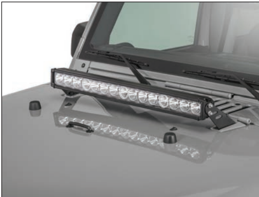
28" Lightbar Hood Mount w/Brackets (#97109.2003)