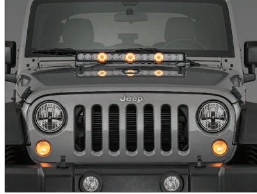
28" Lightbar Hood Mount (Amber Lit)