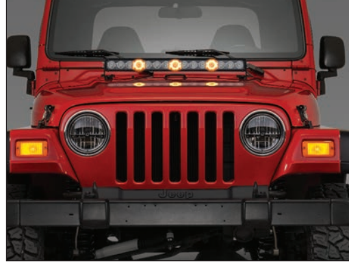
28" Lightbar Hood Mount (Amber Lit)