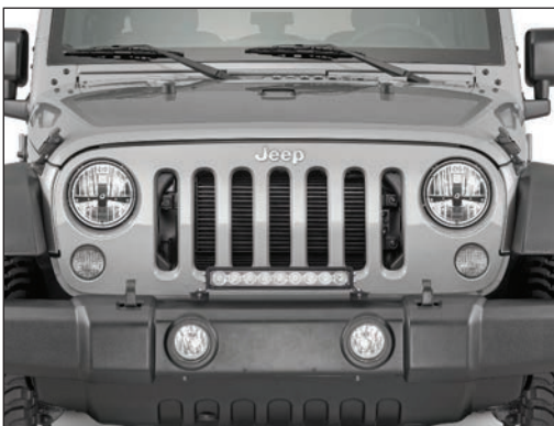
17" Lightbar Bumper Mt. w/Brackets (#12110.2030)