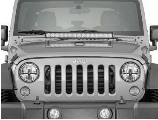
28" Lightbar Hood Mount w/Brackets (#97109.2003)