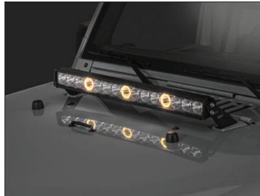
28" Lightbar Hood Mount (Amber Lit)