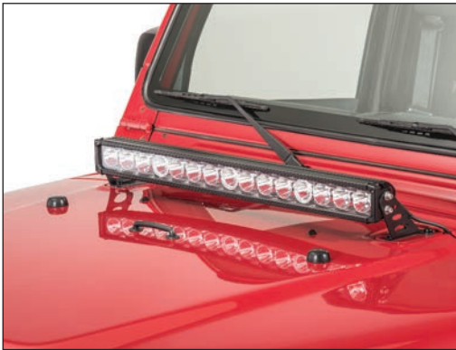
28" Lightbar Hood Mount w/Brackets (#97109.2002)