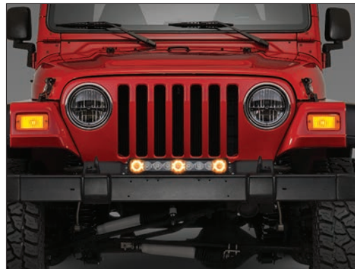
17" Lightbar Bumper Mount (Amber Lit)