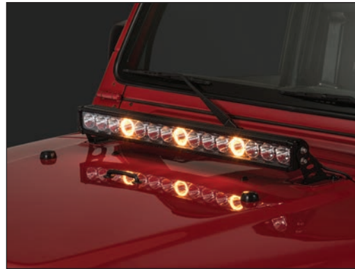
28" Lightbar Hood Mount (Amber Lit)