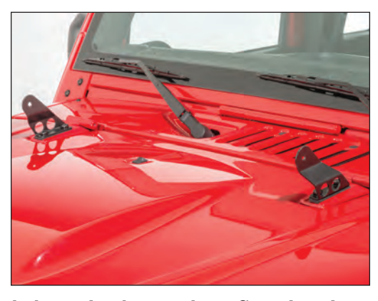
bolts and nylon washers. Snug but do not fully tighten the bolts using a T40 Torx bit or key.