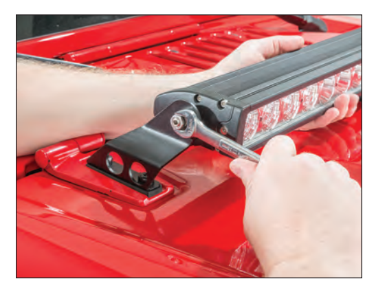
While supporting the light bar pass the stud through the hole on the Passenger hood bracket and secure it with a washer, split washer, and nut. Tighten using a 13mm wrench.