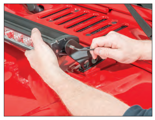
Install the spacer between the bracket and lightbar and install stud through the bracket using a 4mm hex key. Install the washer, split washer and nut and tighten with the 13mm wrench as shown above left.