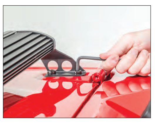
Fully tighten the hood fasteners at this point with a T40 key.