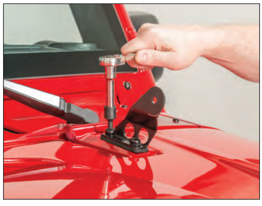
With the Factory bolts removed install the Driver and Passenger brackets as shown with the supplied M8 T40 Torx