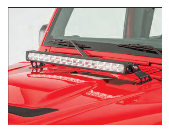
Adjust lightbar to the desired angle, then and tighten the nuts with a 13mm wrench.

Fully tighten all bracket hardware to complete installation.