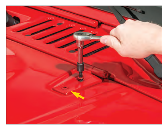
ratchet. (it may be necessary to score the paint around the bolts using and razor blade to prevent paint chipping.)