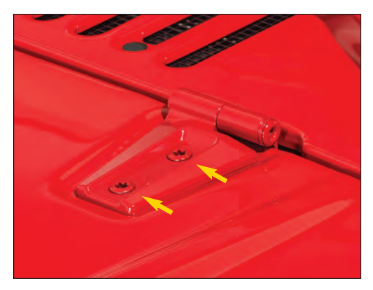
Put on Safety Glasses. With the hood securely latched in place, locate the two T47 Torx bolts on both hood hinges and remove them using a T47 Torx bit and