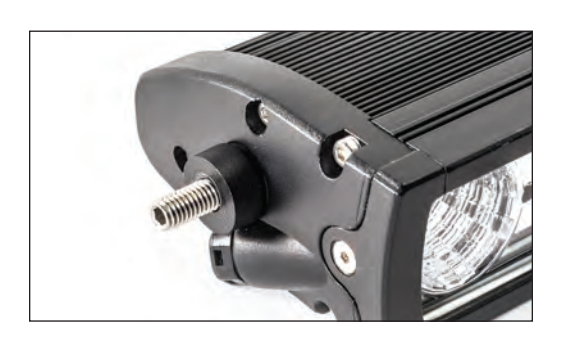
On the Passenger side of the light bar, install one of the M8 studs (supplied with Quadratec light bar) using a 4mm hex key. Also install one of the supplied spacers on the stud.