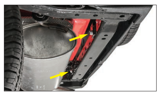
Bracket Installation: Put on Safety Glasses. Locate the two bolts on the back of the vehicle's rear crossmember.

REQUIRED TOOLS: Safety Glasses 16mm Socket and Ratchet