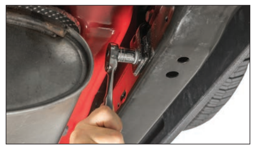
Proceed to Remove the bolts with a ratchet and a 16mm socket. Three mounting holes are provided for various