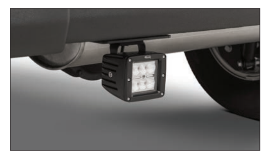
allow for vertical adjustment. If you do not have the factory bumper or mounting brackets you can use a M10 x 1.25 x 35mm bolt. Repeat for opposite side.