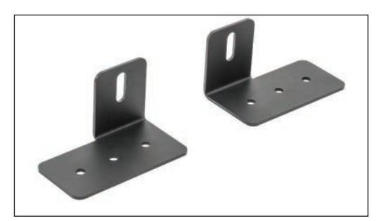
PARTS LIST: Light Mounting Brackets - QTY 2

For '07-'18 Wrangler JK and JKU Vehicles: #97109.2004