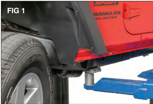
Put on safety glasses. Start the vehicle and turn the wheel to gain access to inner wheel liner. (FIG 1).