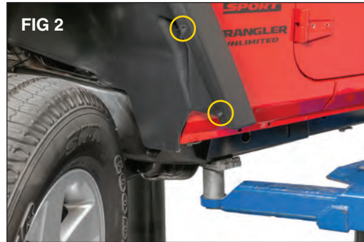
Using diagonal cutting pliers remove the two plastic rivets from the fender flare shown (FIG 2).