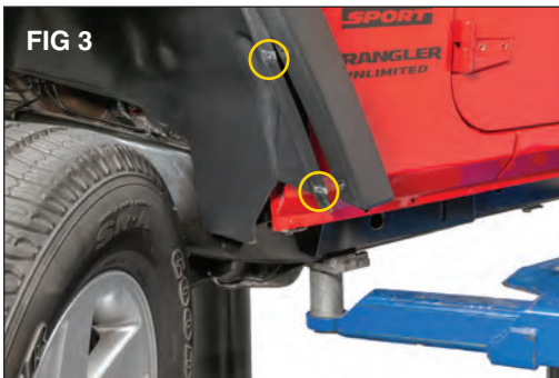
Install the supplied U Nuts on to inner wheel liner in the locations from the two previously removed plastic rivets. (FIG 3).