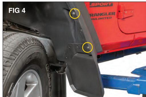
Mount the splash guard to fender flare using two screws into the U nuts. (FIG 4).