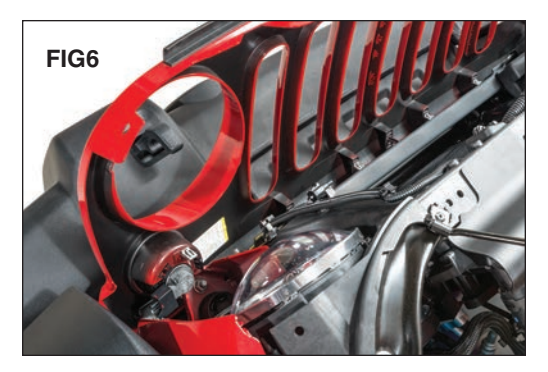
clips. Once the grille is removed and/or tilted forward, locate the chrome trim rings around the Headlights. Using a T15 Torx screw driver, remove the fac-