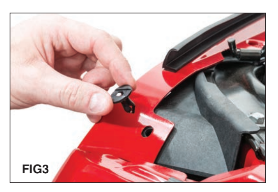
Depending on your model year, pry up or unscrew the plastic fasteners (6 total) using a small screw driver. Early vehicles may feature phillips head screws, but most vehicles have a pry-up rivet as shown (FIG 2). First remove the center, then remove the body of each plastic retainer (FIG 3). Set rivets & screws aside in a safe place for re-installing the grille.

Next, gently tilt the front Grille forward so you can reach the headlight assembly (FIG 4).