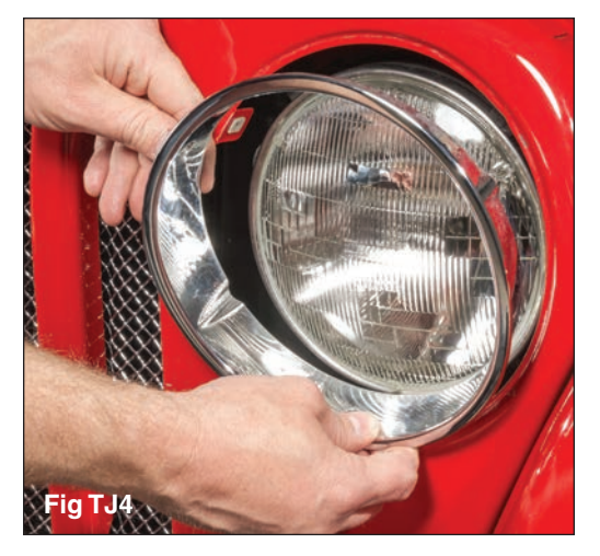
With the headlight bezel removed, the inner headlight retaining ring will be revealed. (see next page)