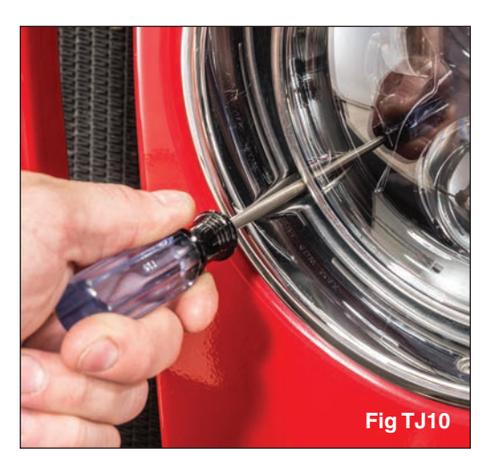
Adjust aim as needed using a T15 torx on the adjusting screws as seen in FIGs TJ9 and TJ10. TJ LED Headlight installation is complete.