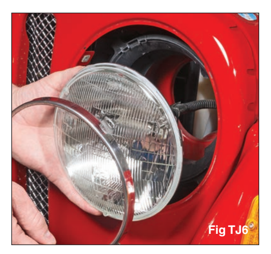
Then unplug and remove the stock headlight as shown in FIGs TJ6 and TJ7.