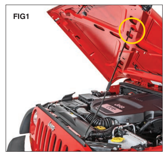
Put on safety glasses. Open the hood of your Jeep<sup>®</sup>. Put the prop rod into the correct slot to hold hood open (FIG 1).