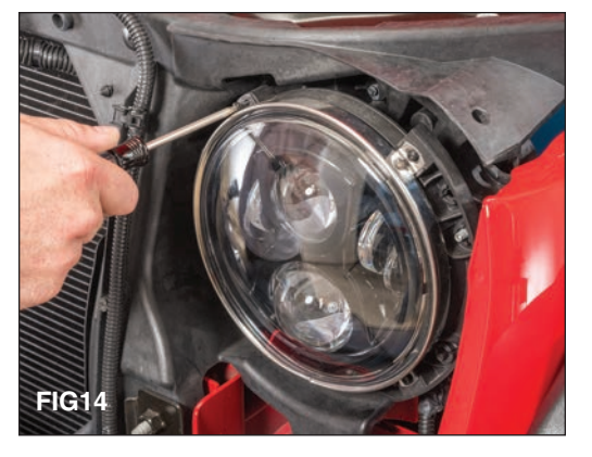
Reinstall headlight trim ring using factory T15 torx screws. (FIG 14) Repeat all above steps for the passenger side headlight. Reinstall the Grill, turn signals, etc. in the reverse order of the disassembly.