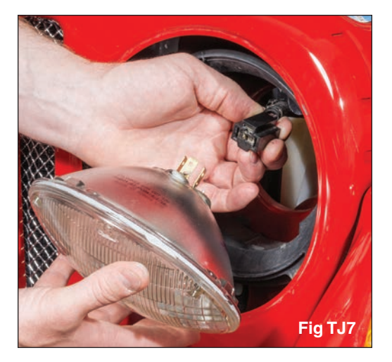
NOTE: You may want to save factory original headlights for future use such as crash repair or otherwise.