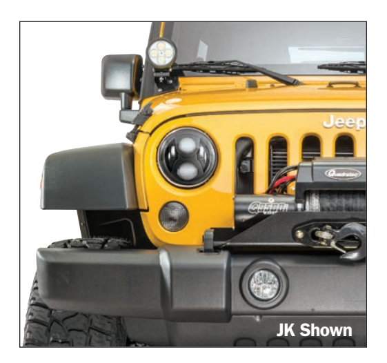
ALWAYS CHECK TURN SIGNAL AND HEADLIGHTS FUNCTION BEFORE DRIVING AFTER HEADLIGHT AND GRILLE INSTALLATION.