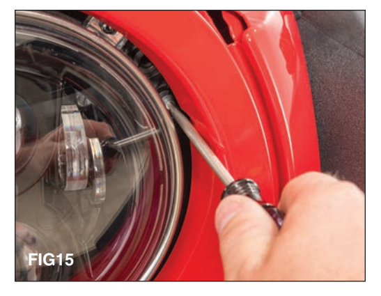
Always check the aim of your headlights before driving and adjust as needed using a T15 torx on the adjusting screws. (FIG15)

JK LED Headlight installation is complete.