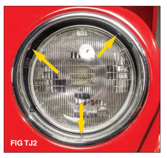
Remove the headlight bezel by first removing the three T15 torx screws shown in FIGs TJ2 and TJ3.