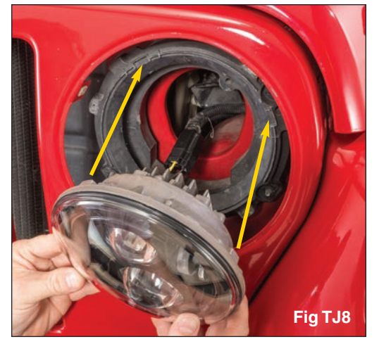
Plug in the new LED headlight. Be sure to align the tabs on the light with the notches in the headlight bucket.