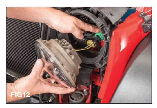
Carefully stow the wiring into the headlight bucket area. Be careful not to pinch any wires. (FIG 12)