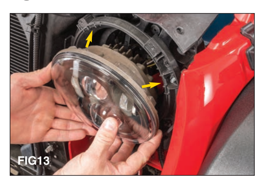
Align the three tabs on the back of the headlight with notches in the headlight bucket. (FIG 13)