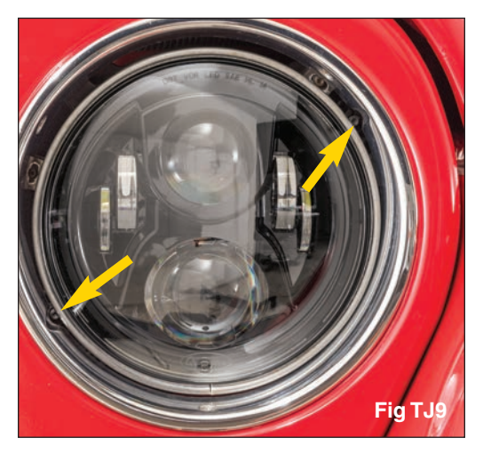
Reassemble with the new LED Headlight in the reverse order. Repeat all steps for opposite side headlight. Always check the aim of your new LED headlights before driving.