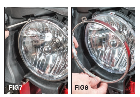
tory headlight trim ring on each headlight (FIG 8). Place the removed screws (4 per light) in a safe place as they will be re-used to install the LED Headlights.