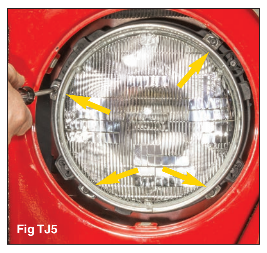
Remove the headlight retaining ring by removing the 4 T15 torx screws as shown in Fig TJ5. Safely set aside the screws for re-installation.