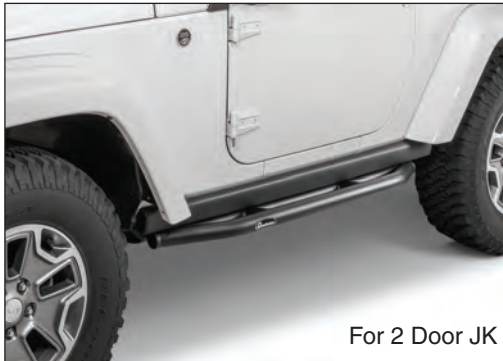
For 2 Door JK