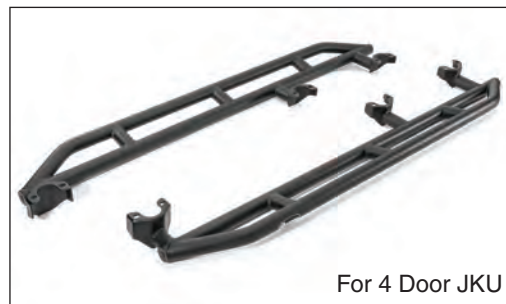
For 4 Door JKU