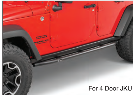
For 4 Door JKU