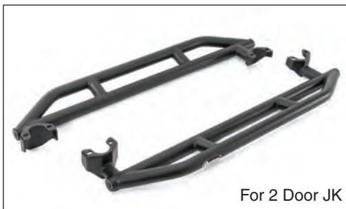
For 2 Door JK