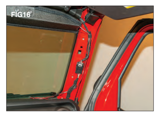
to the brackets using the supplied T-40 torx bolts and washers. Now, route the wiring harness as shown down the A-pillar along side of the factory wiring. (FIG 16)