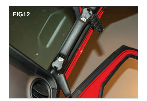
Remove the two bolts using a 10mm socket. (FIG 12) Remove handle and set it aside.