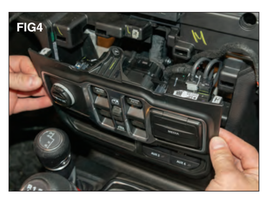
Gently pry out the window control panel from the top and work your way down. (FIG 4)