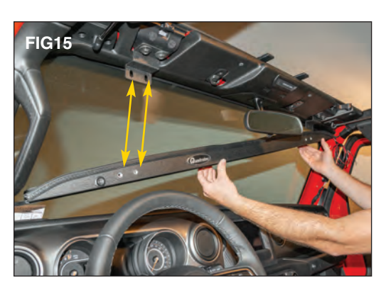
Tilt the light bar into place, careful not to knock off the smaller end gaskets. (FIG 15) Loosely attach the light bar

NOTE THAT THE BRACKET IS NOT SYMMETRIC. THE SLOTS ON THE BRACKETS ARE 2 DIFFERENT SIZES. THE LARGER HOLES MUST BE USED ON THE TOP.