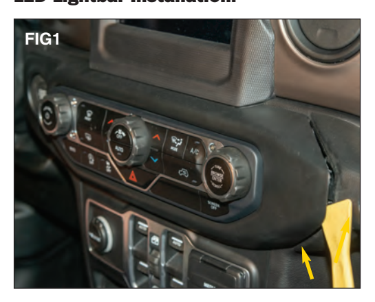
Put on safety glasses. Using a trim clip removal tool gently remove the center dash control center (FIG 1)