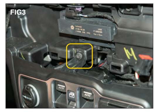
Remove the center screw using a Phillips head screwdriver and set aside. (FIG 3)