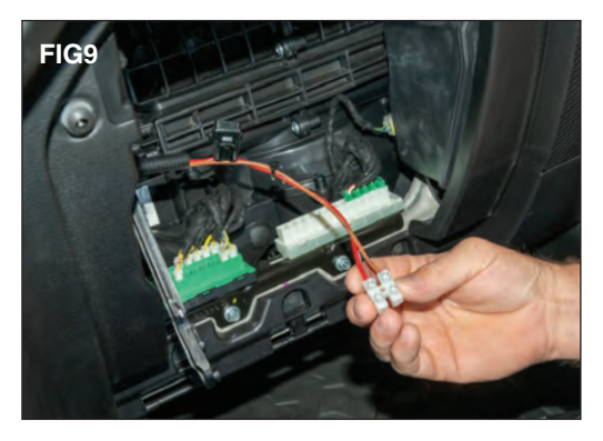
glove box. (FIG 9) You may now replace all of the center dash parts in the reverse order of removal.