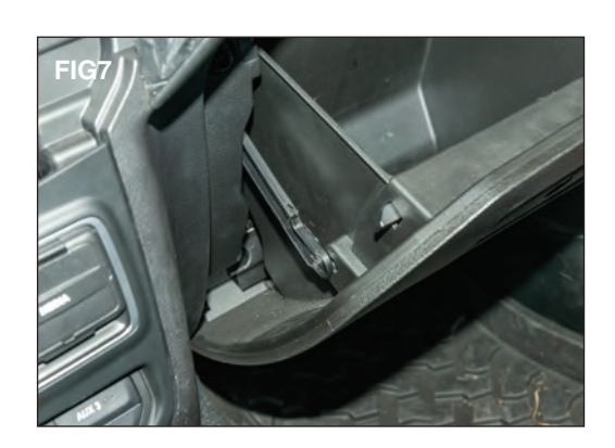
Open the glove box and disconnect the strut on the side by sliding it towards the top of the glove box. (FIG 7)