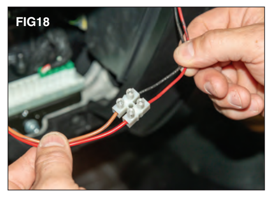
Using a small flat blade screwdriver connect the light bars harness to the power tap harness. (FIG 18) You may now reinstall the glove box in the reverse order.