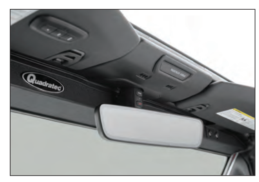
Note : Stealth Light Bar is NOT compatible with vehicles with factory Adaptive Cruise Control (ACC).

NOTE: DO NOT exceed 25 ft. lbs of torque. Installation is now complete.