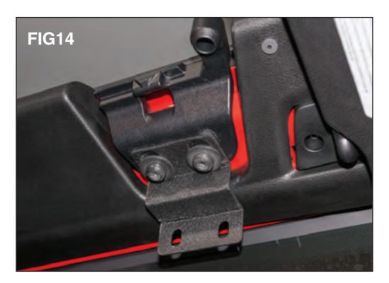
Remove the hardware using a T-40 Torx socket and loosely install the supplied brackets as shown. (FIG 14)