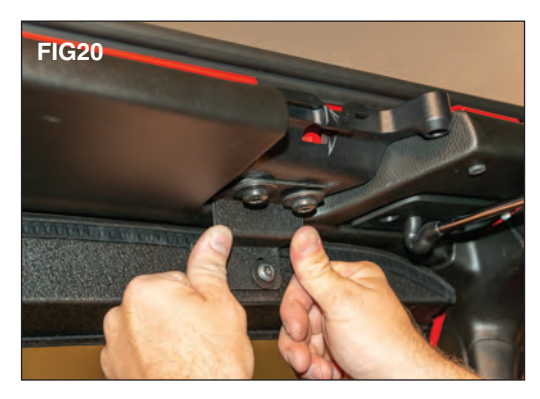
Now push the light brackets forward until they rest against the plastic trim. (FIG 20) You may now tighten the factory T-40 screws. Some adjustment may be necessary to re-align the brackets to your top latches.