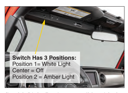
Stealth Light Bar is compatible with the standard rear view mirror as well as the auto-dimming version (above right).

NOTE: DO NOT exceed 25 ft. lbs of torque. Installation is now complete.