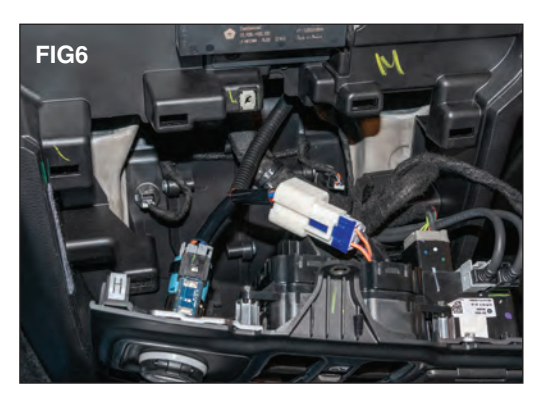
Connect the white connector to the original plug you just disconnected in FIG5. Connect the gray connector back into the 12v socket. (FIG 6)