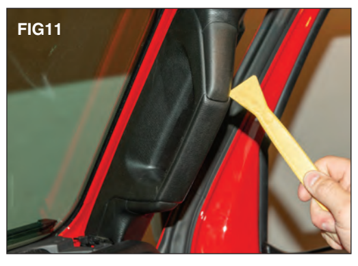
Using a trim tool gently remove the A-pillar grab handle covers. (FIG 11)