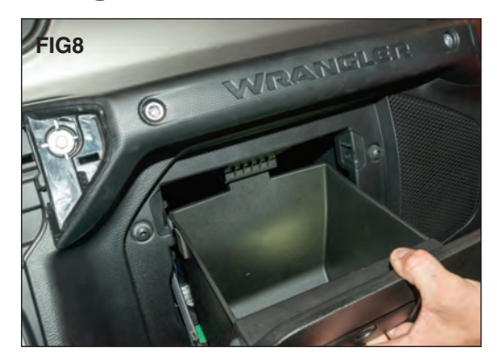
Push up on the glove box stop, tilt it down, remove glove box and set aside. (FIG8) Now, route the new harness through the dash and out behind the