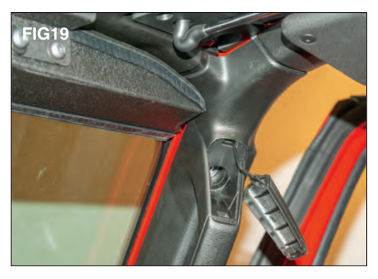
Re-install the grab handle taking care not to pinch any wires. (FIG 19) Also, Re-install the speaker cover.