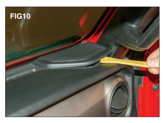
Using a trim tool gently pry up on the dash speaker cover and remove it. (FIG 10)