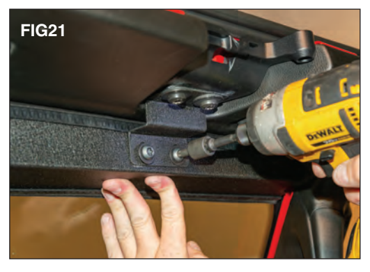
Finally, push up on the light bar and tighten the T-40 screws from bracket to light bar. (FIG 21)