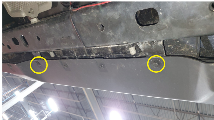
Detail 1: Remove screws under center of bumper