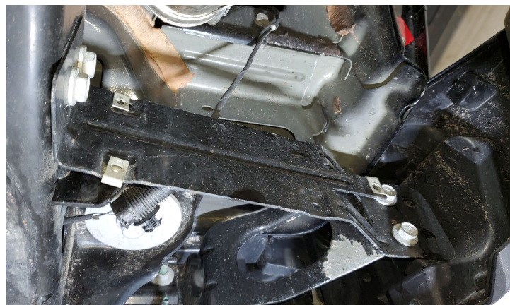
Detail 3: Remove the S-shaped bracket