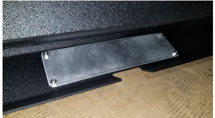
Detail 10: Middle accent plate installed