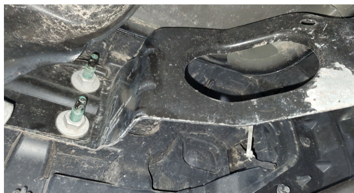
Detail 4: Remove the (2) nuts from each side