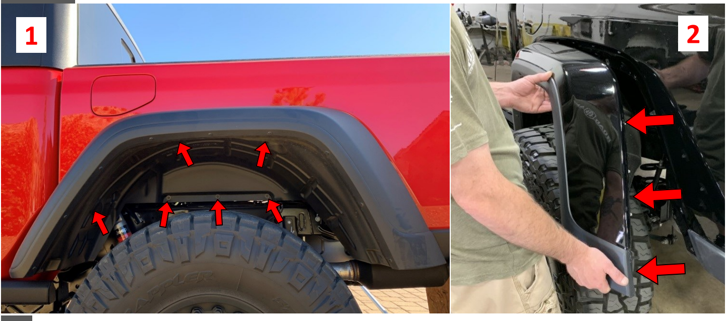
Drill-out 13 existing holes to 3/8" as shown below. (All)

Remove rear fender assembly by firmly pulling on one end of fender until all 12 clips "pop off".