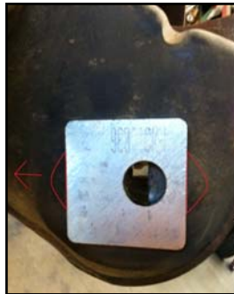
1.5 degree more (positive) caster