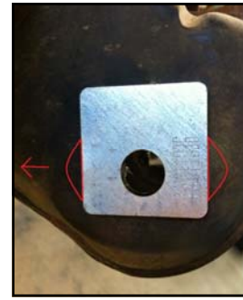
0 degree change from stock. Use like this to weld onto bracket as a repair to a worn out hole