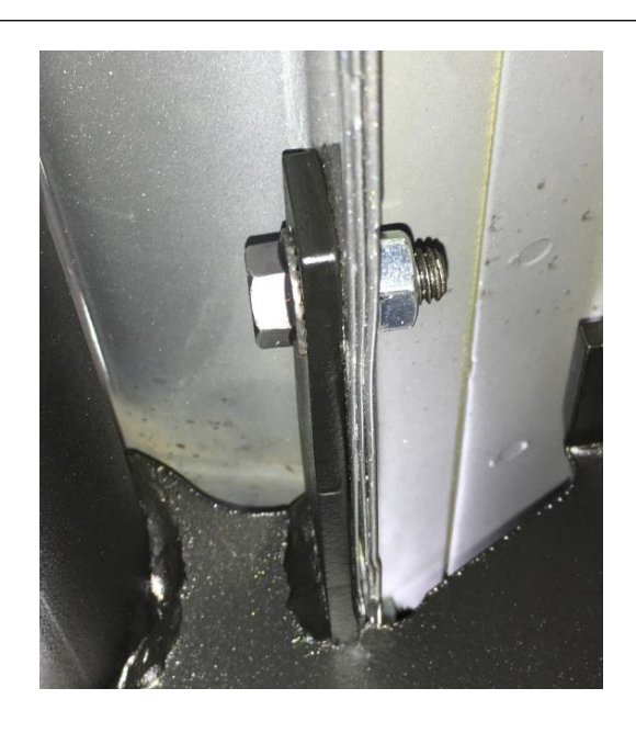
Step 8. Next, tighten the remaining hardware that attaches the bracket to the upper body mount.

Step 7. First, tighten all the hardware that attaches the bracket to the pinch weld of the vehicle.