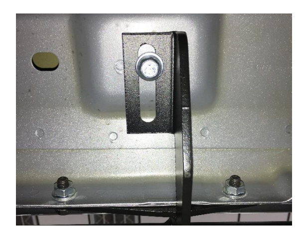
Step 9. Repeat steps 3-8 for the Passenger