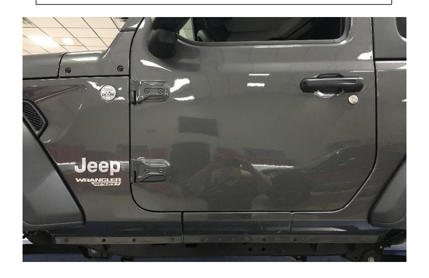
Step 2. Remove the factory running boards and discard.