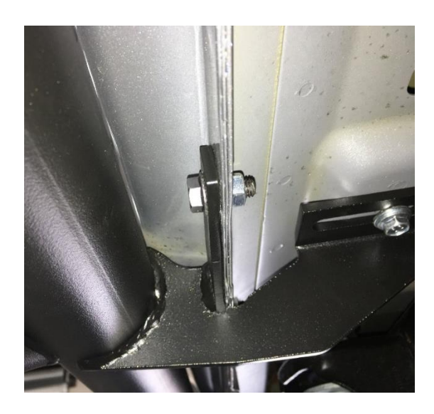
Step 6. Adjust the nerf-step where the main bar is level with the body of the vehicle.