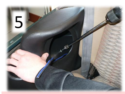
You really only get one good shot at this, so be sure to get the pod squarely in its' sweet spot and the carpet in its' designed, correct position too!

Pull wire through grommet. Hold pod firmly with one hand, drop included self-tap screws into pre-drilled screw holes in bottom of pod. Start with a drill, but consider finishing them with a hand-held 5/16" hex driver. (Metal is pretty thin and a zippy drill may be a little much). Repeat process for the other pod.