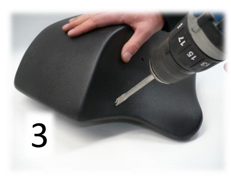
We don't pre-drill wire lead holes so you can put them where you want them. But a good place is the underside of each pod (image 2) so there will be no visible wires once installed. With a pod in place, little pieces of tape on the pod and the carpet can act as markers. Remove the pod, then use a 7/16" paddle bit and drill out the hole about an inch in from the edge (image 3). Repeat process in mirror image for other pod. Install the rubber grommets.