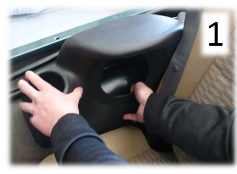
With carpet in it's correct factory position, place a pod on the wheel-well and find the sweet spot by moving it around slightly, but don't screw it in place yet...just get a feel for exactly where it goes.