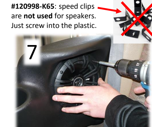
#120998 & #120998-K65: Center speaker in hole and get any logos in desired position. Hold speaker firmly in desired position and use drill with Phillips bit to screw speaker in place. Repeat process for other pod.