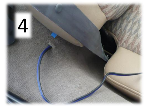
With the tape used as a marker still on the carpet, make a small slit about an inch past the tape so the wire will poke through under the pod when it's installed. Run your speaker wire from your radio or amplifier under the carpet and up through slit so about a foot or wire exits. The wire should only be under the pod in that tiny area and should be away from the pod after that so you get the best fit. Repeat process for the other pod.