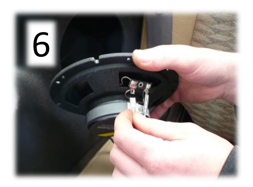
Cut any excess wire to minimize how much will be inside the pod. Connect your speaker. #120998-K65 use the small lengths of wire and red butt connectors that came with your Kicker speakers and connect to the speaker wires in the pods, pos+ to pos+, neg- to neg-. #120998 using your own speakers, similar wiring likely came with your speakers. Repeat process for other pod.

Pull wire through grommet. Hold pod firmly with one hand, drop included self-tap screws into pre-drilled screw holes in bottom of pod. Start with a drill, but consider finishing them with a hand-held 5/16" hex driver. (Metal is pretty thin and a zippy drill may be a little much). Repeat process for the other pod.