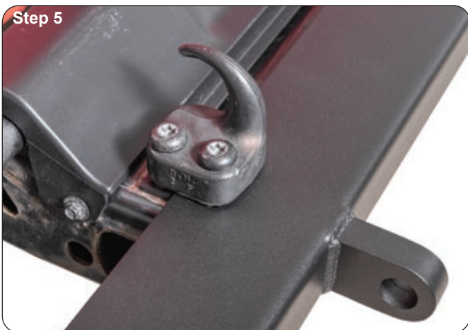
Reinstall the factory tow hooks with the factory fasteners using a T55 Torx. Install a 1/2" bolt, split washer, and flat washer into the lower mounting holes and tighten with a 3/4" socket. (Step 5)