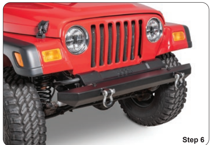
Install D-rings and isolators. (Step 6)