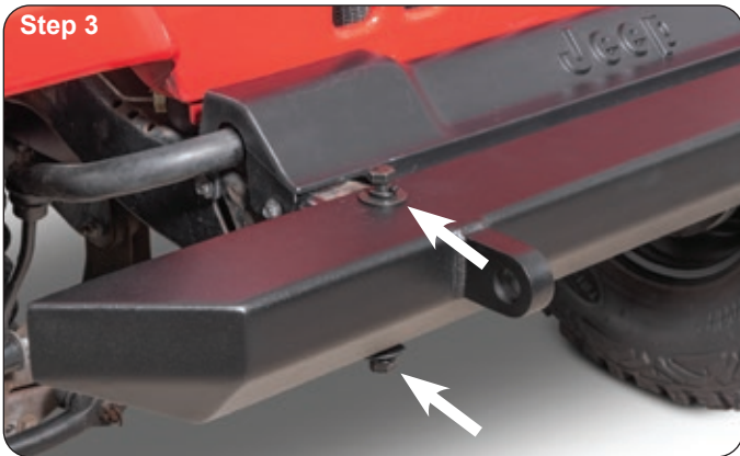
Install the new bumper over the frame rails and align the mounting holes. (Bumper Installation without factory tow hooks) Install a 1/2" bolt, split washer, and flat washer into the upper and lower frame holes on right and left side of the bumper. Tighten with a 3/4" socket (Step 3)