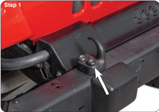
Put on safety glasses. Factory Bumper Removal: Using a T55 bit and socket remove the upper bumper bolts and/or tow hooks on both sides. (Step 1)