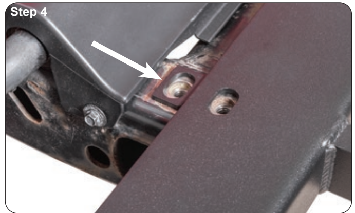
(Bumper Installation with Factory tow hooks) Position a spacer plate over the rear mounting hole on the top of frame. (Step 4)